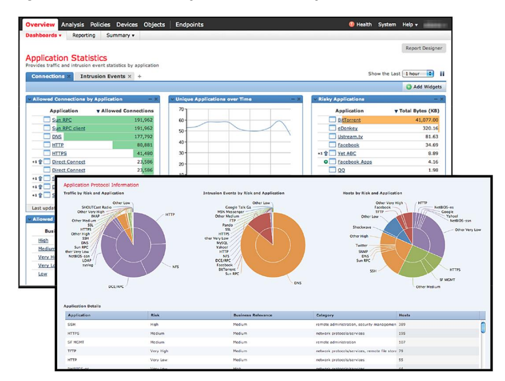
Figure 2. Cisco FireSIGHT Management Center: Intuitive High-level and Detailed Drill-Down Dashboards