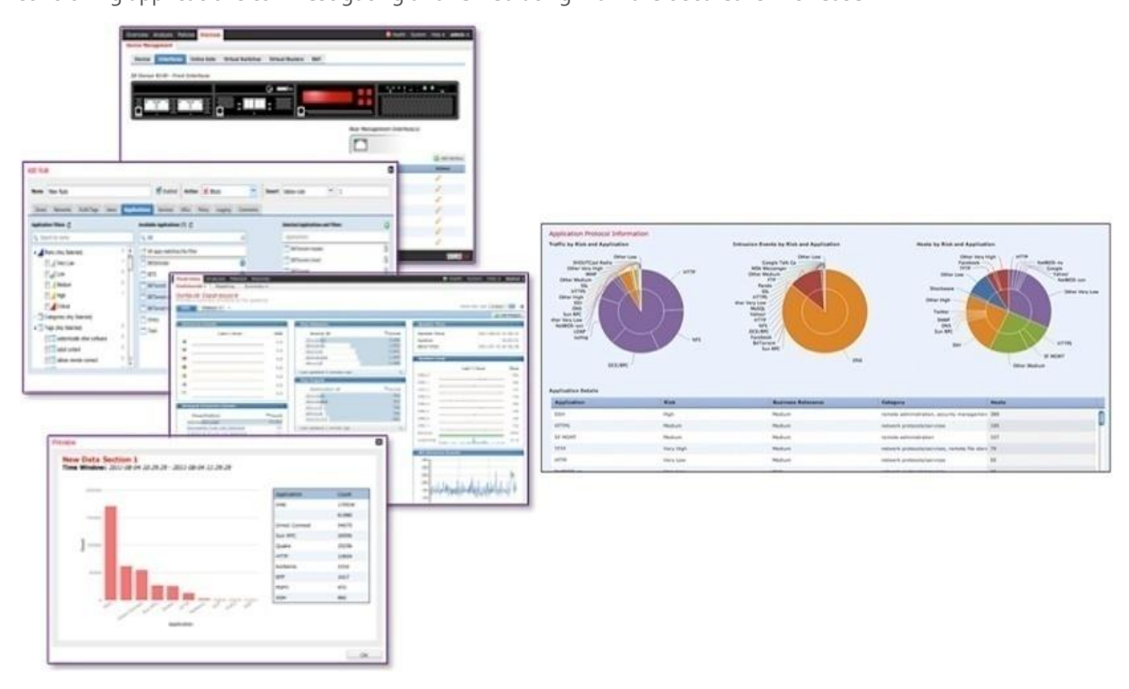
Figure 1. Centralized Policy, Event, and Device Management

The Management Center provides easy-to-use policy screens to control access and guard against known attacks. It integrates with advanced malware protection and sandboxing technology, and it provides tools to track malware infections throughout your network. It unifies all these capabilities in a single management interface. You can go from managing a firewall to controlling applications to investigating and remediating malware outbreaks with ease.