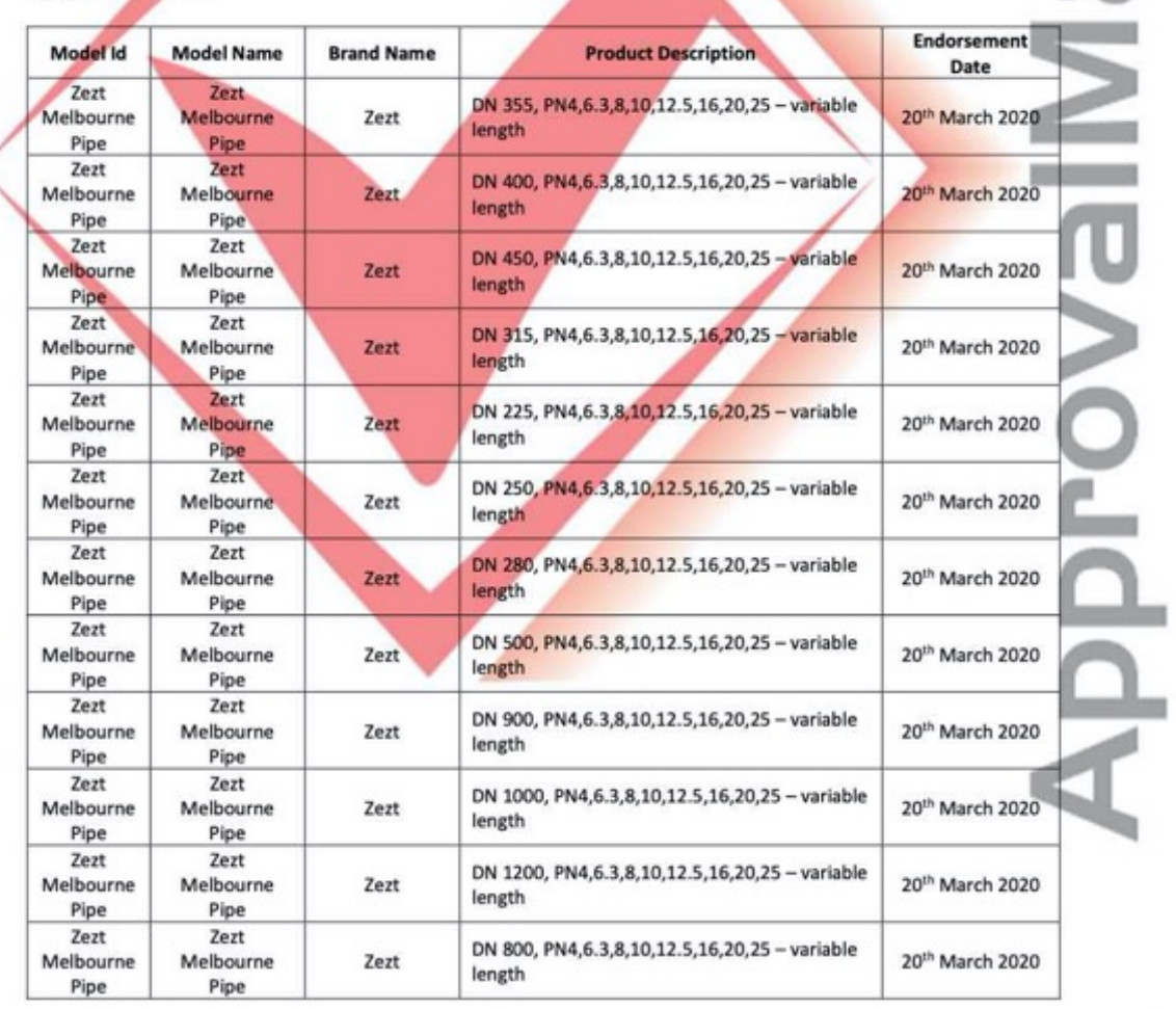
Page 1 of 7