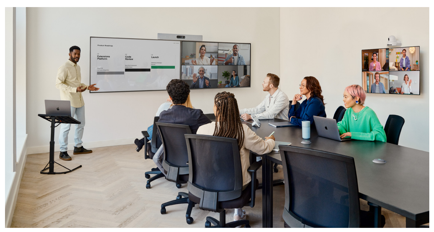
Figure 3. Cisco Room Kit EQ in a large training room featuring the Quad Camera, the PTZ 4K Camera, the Room Navigator tabletop touch controller, and Cisco Table Microphone Pro devices.