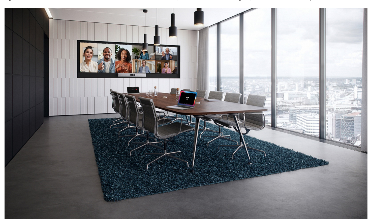
Figure 1. The Cisco Room Kit EQ in a conference room with the Quad Camera, the table-stand Room Navigator, and the Cisco Table Microphone Pro.

The Room Kit EQ provides optionality and extensibility with a highly modular setup to easily add touch controllers, cameras, speakers, microphones, and other room peripherals – easing the configuration and scaling of complex, multi-component audiovisual environments. This solution is rich in functionality and experience yet easy to deploy, maintain, and scale to your workspaces – and comes with unified cloud device management and workspace analytics in Control Hub.