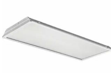
1 Recessed Troffer Fixture 4-ft