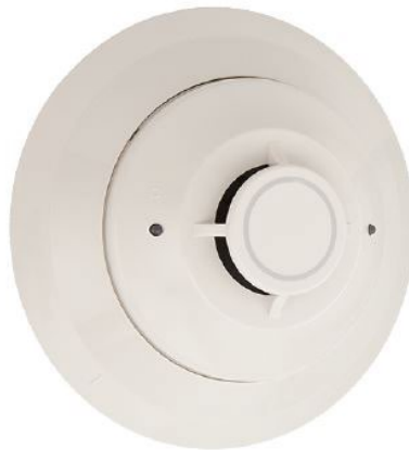
14 Heat Detector

Type: Addressable Heat Detector Mfr: Monaco Enterprises, Inc. Color: White Finish: N/A Model: 721-134-00 Other: 135F rate-of-rise detector