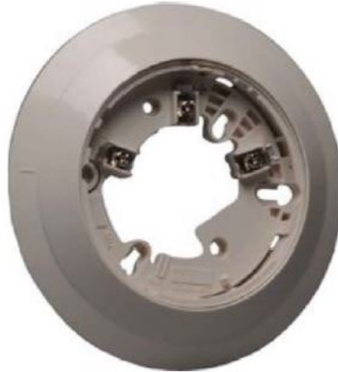
13 Detector base

Type: Heat/Smoke Detector Base Mfr: Monaco Enterprises, Inc. Color: White Finish: N/A Model: 729-132-00 Other: Detector base, plug-in 6.1-inch