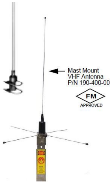
11 Omnidirectional VHF Antenna

Type: Manual Pull Station Mfr: Monaco Enterprises, Inc. Color: Red Finish: N/A Model: 708-026-01 Other: Double Action