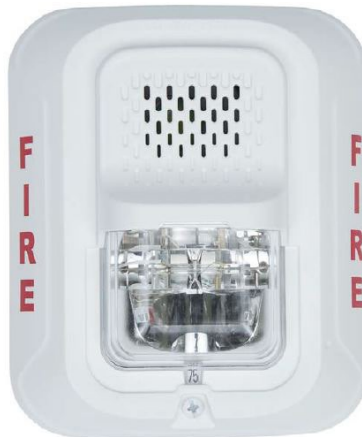
18 Alert Notification device indoor style - wall

Other: Indoor horn/strobe type 1 – Wall mount