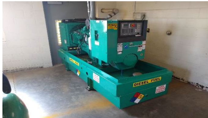
3 Generator indoors sitting on double walled belly tank.