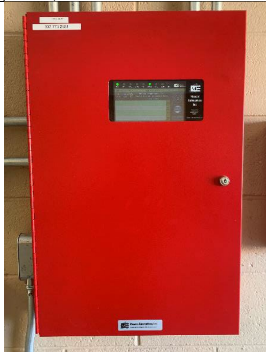
7 Panel exterior