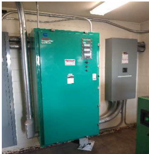
5 ATS indoors

UFGS: Must meet requirements of AFMAN 32-1062, and UFC 3-540-01