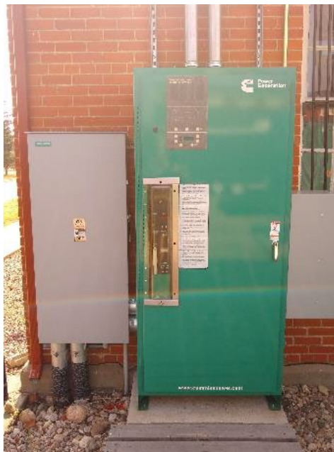
6 ATS outdoors with bypass isolation transfer capability as required by UFC 3-540-01