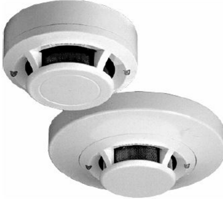
15 Smoke Detector