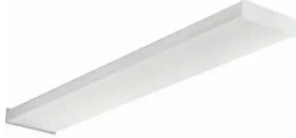
2 LED Wraparound Fixture 4-ft