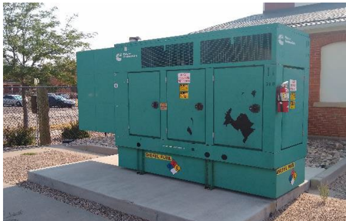
4 Generator outdoors shrouded sitting on double walled belly tank