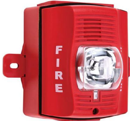
17 Alert Notification device outdoor style wall