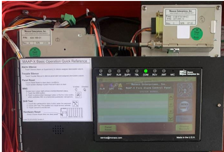
10 Close up of touchscreen inside panel