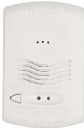
16 Carbon Monoxide Detector