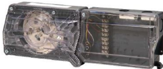
20 Duct Detector