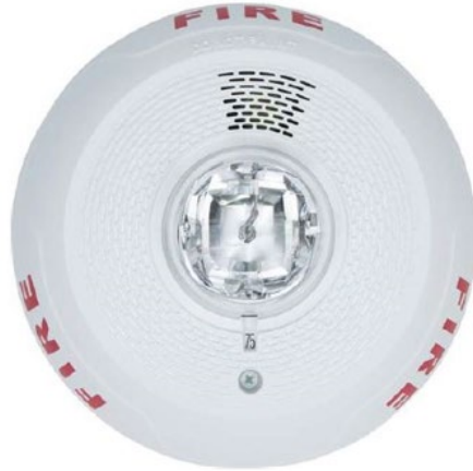
19 Alert Notification device indoor style - ceiling

Other: Indoor horn/strobe type 1 – Ceiling mount