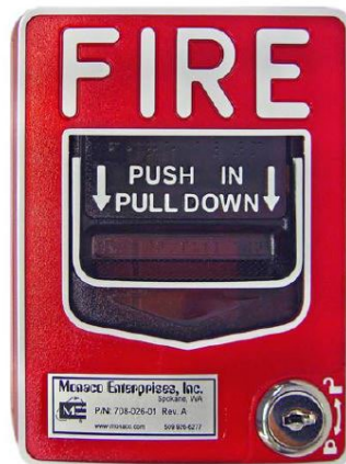
12 Pull Station

Type: Manual Pull Station Mfr: Monaco Enterprises, Inc. Color: Red Finish: N/A Model: 708-026-01 Other: Double Action