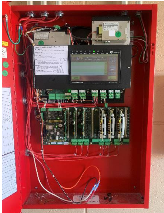
9 Inside FACP