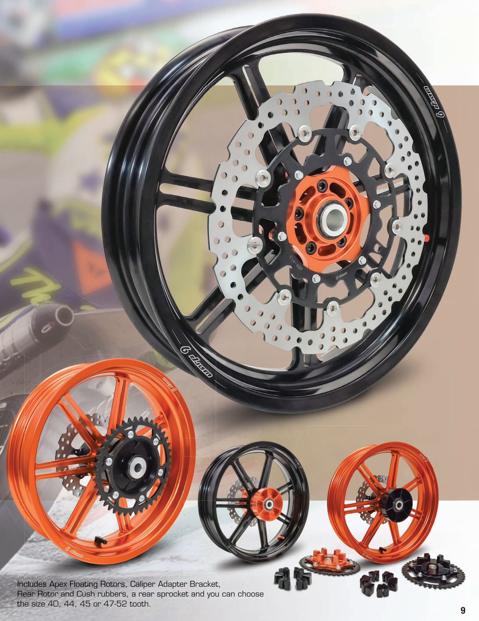
Includes Apex Floating Rotors, Caliper Adapter Bracket, Rear Rotor and Cush rubbers, a rear sprocket and you can choose the size 40, 44, 45 or 47-52 tooth.