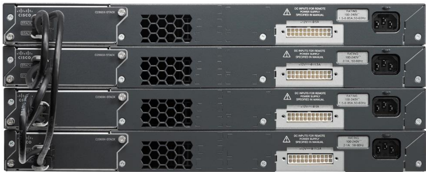
Figure 5. Cisco FlexStack-Plus switch stack