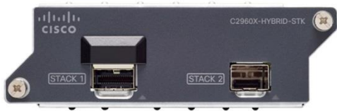
Figure 6. Cisco FlexStack-Extended: Hybrid module