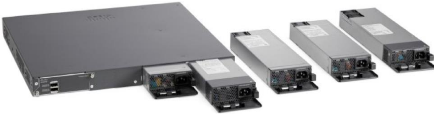
Figure 2. Cisco Catalyst 2960-XR Series power supply

Dual redundant power supplies are supported on the Cisco Catalyst 2960-XR Series Switches. These switches ship with one power supply by default. The second power supply can be purchased at the time of ordering the switch or as a spare. These power supplies have built-in fans to provide cooling (Figure 2).