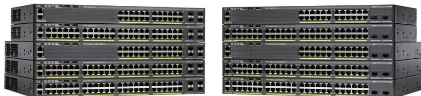
Figure 1. Cisco Catalyst 2960-X Series Switches

Cisco® Catalyst® 2960-X and 2960-XR Series Switches are fixed-configuration, stackable Gigabit Ethernet switches that provide enterprise-class access for campus and branch applications (Figure 1). They operate on Cisco IOS® Software and support simple device management as well as network management. The Cisco Catalyst 2960-X and 2960-XR Series provide easy device onboarding, configuration, monitoring, and troubleshooting. These fully managed switches can provide advanced Layer 2 and Layer 3 features as well as optional Power over Ethernet Plus (PoE+) power. Designed for operational simplicity to lower total cost of ownership, they enable scalable, secure, and energy-efficient business operations with intelligent services. The switches deliver enhanced application visibility, network reliability, and network resiliency.