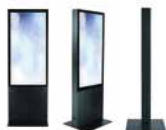
Totems TOT-XXBZ40H-IR10 TOT-XXBZ40H-CA10