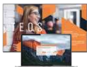
TEOS Connect license TEC-SC100