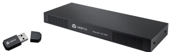
Avocent AV2108 and AV2216 KVM switches are designed for local management of server resources. AutoView KVM switches are easily upgraded for remote management with the purchase of a Remote Access Key.

Virtual Media support allows servers to access storage media attached to the KVM, enabling out-of-band file transfers and OS patch deployments. In high security environments, CAC support with encryption for smart cards and password protection for local users, provides security you can depend on for your virtual media sessions. Encryption options include 128-bit SSL, AES, DES and 3DES and they can be selected for keyboard, mouse and video signals and virtual media sessions.