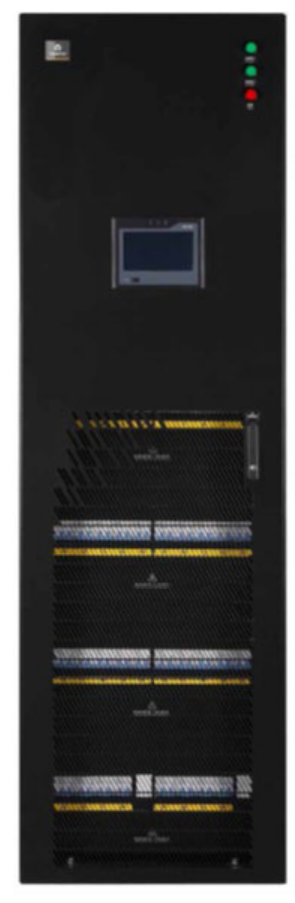
Smart PDU with 7 inch touch screen