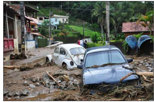
Fig 1. Debris flow, Teresopolis, Brazil 2011

Identifying and understanding thresholds (tipping points) beyond which changes in system behavior become irreversible on human time scales is critical to determining the sustainability of any development trajectory. PIRE research will focus on two very different thresholds. 1) We will investigate the abrupt physical thresholds that define slope instability and the generation and distribution of the destructive and deadly debris flows that result. Slope stability thresholds are not static; they change as land is developed and deforested (Montgomery et al., 2000) and as climate change alters precipitation patterns (Dehn et al., 2000). Mapping and dating older flows will define hazard zones; stochastic models enable flood prediction (Besaw