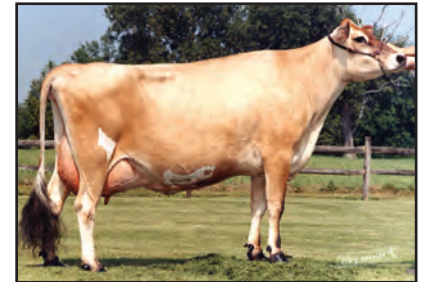
JUNO ROSANNE OF NETTLE CREEK-ET Fourth Dam of Lot 27

RIVER VALLEY CIRCUS CRAZE-ET USA 075341001 GT99K BBR 100 JH1F F A2A2 777JE10001 CDCB GPTA S 08/01/2023 9371DAUS 725HRDS 10%RIP 99%R 229M 0.06% 24F 61%ILE 99%R -0.02% 5P 340CM$ 341NM$ 349FM$ 268GM$ 4.3PL 3.4LIV -0.2DPR 0.4CCR 0.3HCR 2.98SCS 0.2MFV 0.1DAB -0.2KET -1.6MAS 0.4MET -0.1RPL -0.51HTI AJCA 08/01/2023 4322DAUS GPTAT 99%R 2.0 GJUI 16.9 GJPI 99%R 67