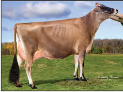
BILLINGS GROVE BRIANNA Grandam of Lot 28

BILLINGS FARM & MUSEUM BREEDER & OWNER WOODSTOCK, VT 802-457-2355