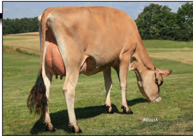
HEATHS HGUN BETTY, E-90% Great-Grandam of Lot 58