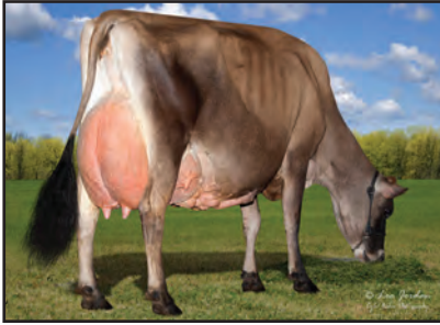
OAKFIELD TBONE VIVIANNE-ET Great-Grandam of Lot 6