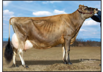
BILLINGS LS BOO BOO Great-Grandam of Lot 19

HAWARDEN JACE PIX 95% USA 114714077 GT3K BBR 100 JH1C F TATTOO /W339 DHIA HERD # 33-87-0722 CONTROL # 10 4-10 305 2 21410 4.8 1026 3.8 823 102DCR 2785C 5-10 305 2 20460 4.9 996 4.0 810 102DCR 2720C 7-01 305 2 16950 4.6 780 3.6 611 102DCR 2094C 8-11 305 2 17020 4.8 819 3.4 585 102DCR 2021C 305 2X ME AVG 7L 19710M 967F 753P 2557C PPA -1222M 43F 16P / YD -2175M -11F -18P CDCB GPTA S 09/05/2023 5RECS 91%R 23%ILE -888M 0.20% -3F 0.12% -8P -28CM$ -40NM$ -129FM$ 0.5PL 0.9LIV 0.6DPR -1.3CCR -1.2HCR 2.92SCS -56GM$ -0.1MFV 0.3DAB -0.1KET 3.2MAS 0.6MET 0.4RPL 6.27HTI AJCA 09/05/2023 GPTAT 87%R 0.6 GJUI -0.4 GJPI 87%R -4