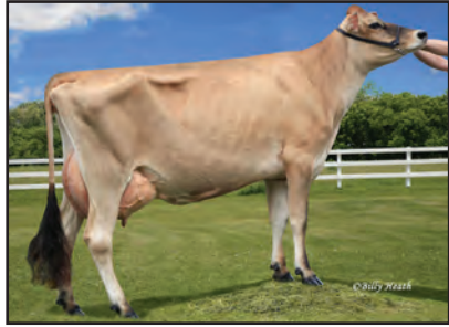
THREE VALLEYS TBONE C MAYBELL-ET Great-Grandam of Lot 60