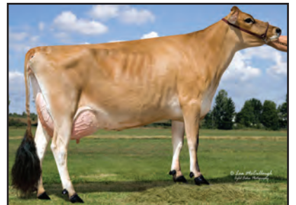
HEARTLAND ABE AVALANCHE Fourth Dam of Lot 82