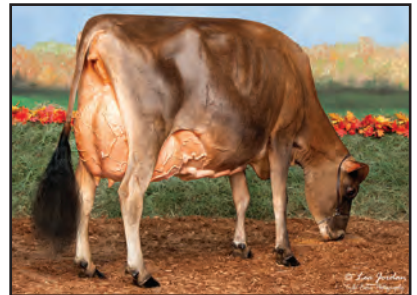
BILLINGS JOEL BULGHUR-ET Sister to the Grandam of Lot 19

BILLINGS SULTAN BRYCE 95% USA 115187742 GT13K BBR 100 JH1F F TATTOO /BF966 DHIA HERD # 13-14-0202 CONTROL # 966 2-01 275 2 13080 4.9 638 3.9 504 98DCR 1721C 3-00 305 2 16430 5.1 838 4.0 661 102DCR 2260C 4-01 305 2 16400 4.9 802 3.8 627 102DCR 2153C 5-01 295 2 14850 4.9 725 3.9 578 102DCR 1963C 6-01 305 2 18110 4.9 895 3.7 675 102DCR 2335C 7-01 305 2 17180 4.8 831 3.8 661 102DCR 2248C 8-02 305 2 19880 4.6 911 3.6 711 98DCR 2442C 9-06 281 2 17720 4.4 787 3.5 626 95DCR 2126C 10-05 305 2 18450 4.8 877 3.5 641 98DCR 2215C 11-08 305 2 17250 4.8 826 3.6 628 97DCR 2172C 12-09 305 2 17950 5.0 901 3.9 695 97DCR 2405C 305 2X ME AVG 11L 18166M 883F 680P 2331C PPA -2973M -126F -78P / YD -2365M -84F -65P CDCB GPTA S 09/05/2023 5RECS 86%R 11%ILE -1093M 0.08% -36F 0.04% -32P -261CM$ -261NM$ -264FM$ 1.6PL 0.2LIV 0.5DPR 1.3CCR -1.4HCR 3.03SCS -298GM$ -0.1MFV-0.1DAB -0.6KET 1.6MAS 0.2MET -0.1RPL 0.59HTI AJCA 09/05/2023 GPTAT 85%R 1.2 GJUI 21.8 GJPI 82%R -53 1ST 100,000-LB CLASS, 2015 EASTERN STATES EXPOSITION HONORABLE MENTION GRAND, 2015 EASTERN STATES 1ST 100,000 LB CLASS, 2015 NEW YORK SPRING CAROUSEL 6TH SENIOR TWO-YEAR-OLD, 2009 NEW YORK SPRING CAROUSEL SIRE: SHF CENTURION SULTAN GJPI -49 4%ILE