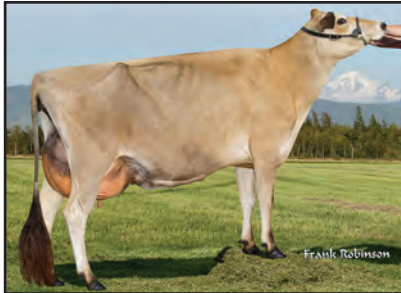
FAMILY HILL SOCRATES FLYNN-ET Sister to the Grandam of Lot 81