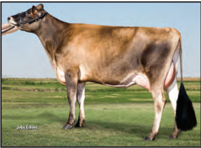
JX GOFF BARNABAS 26632 {3}-ET Sister to the Grandam of Lot 18

BORN 07/26/2021 P4 FEMALE EFI 8.3% AMERICAN ID 738/738