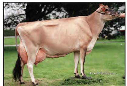
SUNSET CANYON MBSB ANTHEM Excellent-95% Fifth Dam of Lot 59