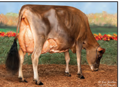
BILLINGS JOEL BULGHUR-ET Sister to the Grandam of Lot 22

SISTER(S): BILLINGS SULTAN BRYCE 95% 8-02 305 2 19880 4.6 911 3.6 711 98DCR 2442C BILLINGS JADE BRYANT 92% 4-02 305 2 20260 5.3 1082 3.9 786 102DCR 2720C BILLINGS MINISTER BREIGH 92% 6-05 305 2 16930 5.5 925 3.9 664 98DCR 2298C BILLINGS IMPRESSION BACKFIRE-ET 90% 4-04 305 2 14050 3.9 551 3.3 460 46DCR 1517C BILLINGS IMPRESSION OF BOOBOO-ET 92% 4-02 305 2 23380 4.9 1142 3.5 824 98DCR 2848C BILLINGS FIRST IMPRESSION-ET 90% 4-09 305 3 20720 4.4 918 3.6 746 96DCR 2503C BILLINGS IMPRESSION BACKSTAGE-ET 93% 4-09 298 3 20910 6.2 1287 3.6 763 86DCR 2639C BILLINGS VELOCITY BEEBAUM-ET 90% 5-10 305 2 26350 5.4 1415 3.5 923 104DCR 3190C BILLINGS JOEL BISCUIT-ET 90% 4-04 305 2 17580 5.5 963 3.9 694 98DCR 2402C BILLINGS JOEL BULGHUR-ET 94% 5-08 305 2 21640 4.6 987 3.7 803 98DCR 2693C BILLINGS JOEL BISQUICK-ET 87% 3-05 305 2 15280 5.3 804 3.9 589 98DCR 2038C BILLINGS COLTON BOUNCE-ET 87% 2-01 305 2 13570 5.1 688 4.0 549 97DCR 1864C BILLINGS COLTON BONGO-ET 92% 4-11 305 2 13600 4.7 645 3.7 504 96DCR 1731C