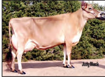
PLEASANT NOOK BERRETTA FELICE Great-Grandam of Lot 81