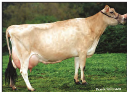
TENN HAUG E MAID Excellent-93% Sixth Dam of Lot 60

BORN 09/01/2021 P5 FEMALE EFI 9.5% AMERICAN ID 180/180