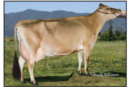
SUNSET CANYON F PRIZE T ANTHEM-ET Great-Grandam of Lot 59

4TH DAM: SUNSET CANYON THUNDER ANTHEM 3-ET 93% 4-04 365 2 30118 5.2 1573 3.7 1125 DHIR 3892C