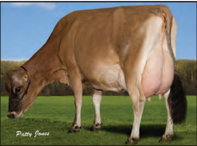
GABYS ACTION BABY-ET Great-Grandam of Lot 83

GABYS TBONE BUTTERCUP-ET 95% USA 116842763 GT3K BBR 100 JH1F F A2A2 TATTOO G1707/G1707 DHIA HERD # 31-38-4607 CONTROL # 1707 2-00 305 2 17930 5.1 922 3.7 672 101DCR 2325C 3-02 273 2 15660 5.1 798 3.9 603 96DCR 2087C 4-04 305 2 24770 5.7 1410 3.9 964 91DCR 3337C 5-06 305 2 25020 5.6 1389 3.8 942 97DCR 3259C 6-09 305 2 23280 6.1 1423 3.8 887 98DCR 3069C 8-01 243 2 17750 5.5 979 3.7 662 94DCR 2290C 305 2X ME AVG 6L 22344M 1230F 852P 2947C PPA 190M 120F 37P / YD -344M 81F 23P CDCB GPTA S 10/03/2023 4RECS 88%R 35%ILE -490M 0.18% 14F 0.08% -2P 72CM$ 64NM$ 4FM$ 0.4PL 0.8LIV -0.7DPR -0.6CCR 0.9HCR 2.98SCS 38GM$ -0.1MFV -0.2DAB 0.0KET 0.6MAS 0.3MET 0.1RPL -0.70HTI AJCA 10/03/2023 GPTAT 84%R 1.1 GJUI 4.9 GJPI 83%R 14