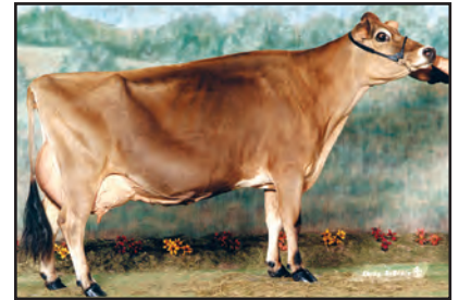
AVONLEA D JUDE KARMELE Excellent-94% Fifth Dam of Lot 25

RIVER VALLEY VENUS VIP-ET JE840003126479167 GT99K BBR 100 JH1F F A1A2 777JE10003 CDCB GPTA S 08/01/2023 952DAUS 320HRDS 25%RIP 99%R -2112M 0.14% -75F 1%ILE 99%R 0.08% -63P -598CM$ -596NM$ -592FM$ -654GM$ 0.5PL 2.4LIV -0.2DPR -0.1CCR -0.5HCR 3.16SCS 0.0MFV -0.2DAB -0.3KET 0.0MAS 0.7MET 0.4RPL -0.79HTI AJCA 08/01/2023 736DAUS GPTAT 98%R 1.5 GJUI 20.8 GJPI 95%R -138