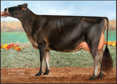
BILLINGS IMPRESSION BACKSTAGE-ET Full Sister to the Grandam of Lot 22

MB LUCKY LADY FIREBALL-ET 92% JECAN000108617709 GT BBR 100 JH1F F A1A2 DHIA HERD # 13-14-0202 CONTROL # 709 PPA -3859M -92F -132P / YD -3888M -85F -126P CDCB GPTA S 09/05/2023 3RECS 81%R 1%ILE -1928M 0.21% -53F 0.01% -69P -662CM$ -652NM$ -593FM$ -1.4PL -1.0LIV 1.4DPR 2.0CCR -1.7HCR 3.19SCS -630GM$ -0.1MFV -0.3DAB -0.4KET 0.6MAS 0.1MET 0.5RPL -1.47HTI AJCA 09/05/2023 GPTAT 81%R 0.6 GJUI 5.7 GJPI 77%R-149