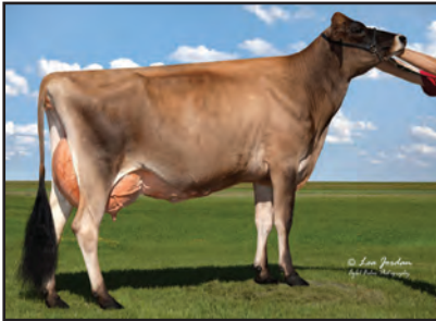
KEVETTA APPLEJACK VEGAS Sister to the Grandam of Lot 6