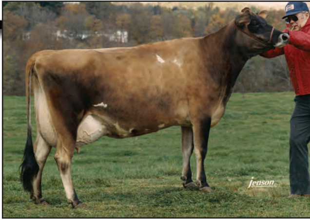
BILLINGS TOP ROSANNE, E-96% Fifth Dam of Lot 27