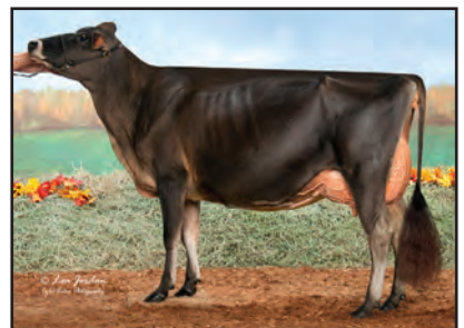
BILLINGS IMPRESSION BACKSTAGE-ET Sister to the Grandam of Lot 19

SISTER(S): BILLINGS JADE BRYANT 92% 4-02 305 2 20260 5.3 1082 3.9 786 102DCR 2720C BILLINGS MINISTER BREIGH 92% 6-05 305 2 16930 5.5 925 3.9 664 98DCR 2298C BILLINGS IMPRESSION BACKFIRE-ET 90% 4-04 305 2 14050 3.9 551 3.3 460 46DCR 1517C BILLINGS IMPRESSION OF BOOBOO-ET 92% 4-02 305 2 23380 4.9 1142 3.5 824 98DCR 2848C BILLINGS FIRST IMPRESSION-ET 90% 4-09 305 3 20720 4.4 918 3.6 746 96DCR 2503C BILLINGS IMPRESSION BACKSTAGE-ET 93% 4-09 298 3 20910 6.2 1287 3.6 763 86DCR 2639C BILLINGS VELOCITY BEEBAUM-ET 90% 5-10 305 2 26350 5.4 1415 3.5 923 104DCR 3190C BILLINGS JOEL BISCUIT-ET 90% 4-04 305 2 17580 5.5 963 3.9 694 98DCR 2402C BILLINGS JOEL BULGHUR-ET 94% 5-08 305 2 21640 4.6 987 3.7 803 98DCR 2693C BILLINGS COLTON BONGO-ET 92% 4-11 305 2 13600 4.7 645 3.7 504 96DCR 1731C