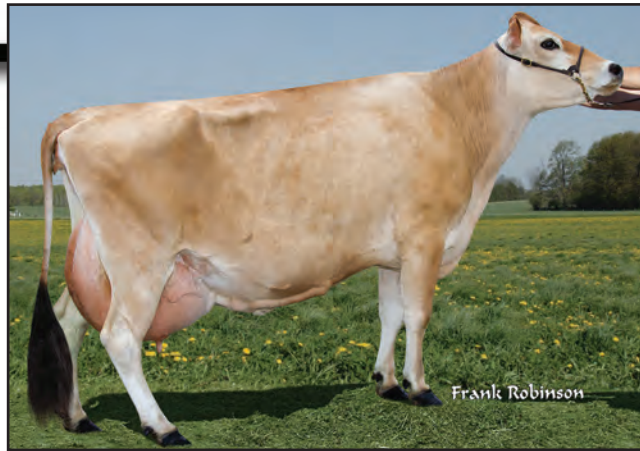
HIGH LAWN CATAMONT MILLICENT, E-90% Fifth Dam of Lot 56