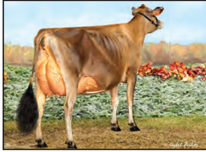
BILLINGS IMPRESSION OF BOOBOO-ET Full Sister to the Grandam of Lot 22