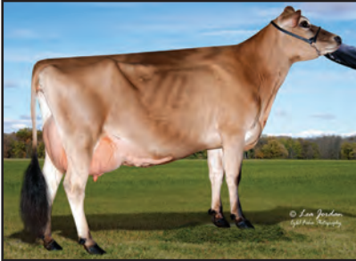
SCENIC VIEW MESCHACH BUTTERCUP-P-ET Sister to the Dam of Lot 83

BORN 12/21/2020 P2 FEMALE EFI 9.1% AMERICAN ID 20045/20045