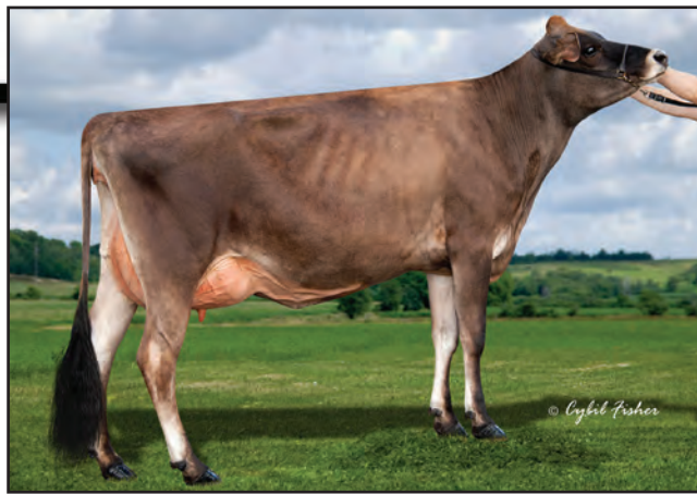
DISCOVERYS SHOWDOWN GIOVANNA-ET, VG-88% Grandam of Lot 20