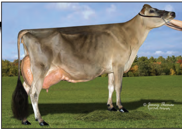
BRYANT FARM ACADEMY FRENZI, E-94% Grandam of Lot 21