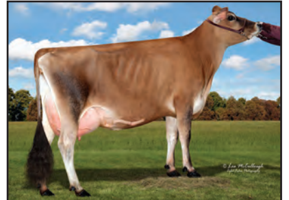
HEARTLAND TOPEKA ATHENA-ET Great-Grandam of Lot 82