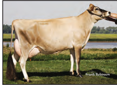
THREE VALLEYS COUNTRY MAID 3-ET Fourth Dam of Lot 60