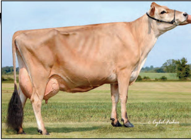
RATLIFF F PRIZE KIRBY-ET, E-90% Fourth Dam of Lot 25