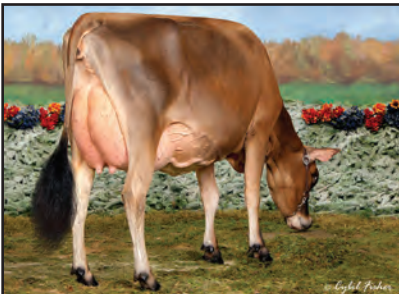
HOMETOWN APPLEJACK GORGEOUS Sister to the Grandam of Lot 83

SIRE: RICHIES JACE TBONE A364 GJPI -20 6%ILE