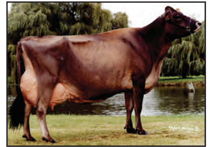
BLACKY ROSE OF BRIARCLIFFS Excellent-96% Seventh Dam of Lot 21

ALL LYNNS LOUIE VALENTINO-ET USA 116279413 GT50K BBR 100 JH1C F A2A2 7JE1038 CDCB GPTA S 08/01/2023 23664DAUS 2642HRDS 4%RIP 99%R 324M -0.10% -5F 15%ILE 99%R -0.03% 5P 76CM$ 78NM$ 99FM$ -42GM$ 2.4PL 3.4LIV -2.2DPR -2.9CCR -0.2HCR 2.95SCS 0.3MFV 0.6DAB 0.4KET 1.1MAS 1.1MET 0.4RPL 8.77HTI AJCA 08/01/2023 10319DAUS GPTAT 99%R 1.0 GJUI 6.6 GJPI 99%R 9