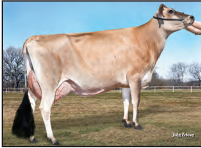
JX GOFF ACTION 8493 {2} Great-Grandam of Lot 18