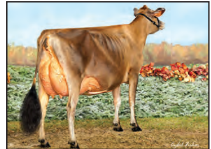
BILLINGS IMPRESSION OF BOOBOO-ET Sister to the Grandam of Lot 19

RIVER VALLEY SPICE SHOWDOWN JE840003012423904 GT80K BBR100 JH1F F A1A2 7JE5015 CDCB GPTA S 08/01/2023 636DAUS 292HRDS 4%RIP 98%R -942M 0.13% -19F 3%ILE 98%R 0.11% -12P -240CM$ -245NM$ -314FM$ -227GM$ -2.0PL 0.2LIV -0.1DPR -0.9CCR 0.7HCR 3.22SCS 0.0MFV 0.1DAB 0.4KET -0.6MAS 0.7MET 0.1RPL 0.21HTI AJCA 08/01/2023 489DAUS GPTAT 97%R 0.1 GJUI -2.7 GJPI 95%R -52