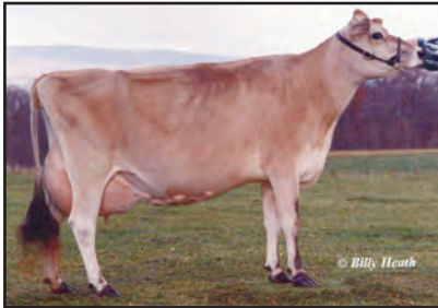
GLENLAMB MARY IMP BET 3B Excellent-92% Fifth Dam of Lot 58