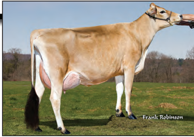
HIGH LAWN VIBRANT DANCE TIME, VG-84% Great-Grandam of Lot 46