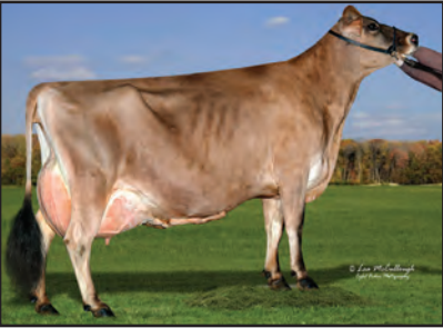
GABYS TBONE BUTTERCUP-ET Grandam of Lot 83

SHAN-MAR HILARIO CHARLENE-ET 90% USA 067180910 GT8K BBR 100 JH1F F DHIA HERD # 23-03-0154 CONTROL # 910 2-02 305 2 17880 5.7 1021 4.2 744 101DCR 2577C 3-08 305 2 21320 6.2 1321 4.2 904 102DCR 3132C 4-10 305 2 19200 6.3 1210 4.4 845 102DCR 2929C 305 2X ME AVG 4L 19559M 1157F 824P 2854C PPA 195M 209F 98P / YD -230M 139F 67P CDCB GPTA S 10/03/2023 4RECS 91%R 79%ILE -380M 0.30% 45F 0.18% 24P 332CM$ 316NM$ 156FM$ 0.0PL -0.2LIV -0.4DPR -0.9CCR -0.3HCR 3.18SCS 328GM$ 0.1MFV 0.0DAB -0.2KET -1.9MAS 0.3MET 0.1RPL -2.40HTI AJCA 10/03/2023 GPTAT 88%R 0.2 GJUI -3.8 GJPI 88%R 64