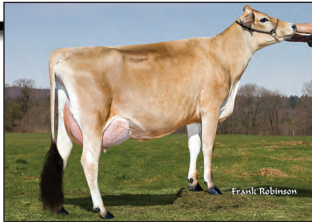
HIGH LAWN RENEGADE CELIA, VG-85% From the Same Family as Lot 52