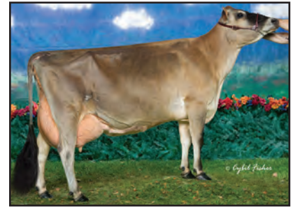
LADYHOLM-N JEWELS JADE Fourth Dam of Lot 23

CHILLI ACTION COLTON-ET USA 066738335 GT50K BBR 100 JH1F F A2A2 7JE1088 CDCB GPTA S 08/01/2023 5619DAUS 1419HRDS 8%RIP 99%R -1735M 0.30% -25F 3%ILE 99%R 0.11% -42P -268CM$ -268NM$ -306FM$ -263GM$ -0.3PL 0.5LIV 0.2DPR -0.2CCR 0.3HCR 3.29SCS 0.0MFV 0.2DAB -0.2KET -0.2MAS 0.6MET 0.3RPL 0.71HTI AJCA 08/01/2023 3329DAUS GPTAT 99%R 1.7 GJUI 16.0 GJPI 99%R -65