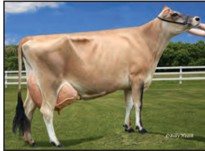
FAMILY HILL REN FLIRT-ET Sister to the Grandam of Lot 81

BORN 11/29/2021 TATTOO /KV8 PO FEMALE EFI 8.1%