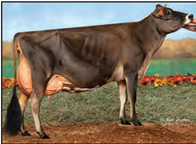
DISCOVERYS TEQUILA JEWELENE Great-Grandam of Lot 20

NEXT DAM: DISCOVERYS TEQUILA JEWELENE 96% 5-11 353 2 18458 6.3 1159 4.3 788 DHIR 2731C NATIONAL GRAND CHAMPION, 2017 WINNER, 2014 NATIONAL JERSEY JUG FUTURITY ALL AMERICAN 4-YEAR-OLD COW, 2015 ALL AMERICAN 5-YEAR-OLD COW, 2016 RESERVE ALL AMERICAN JUNIOR YEARLING, 2012 NOMINATED ALL AMERICAN JUNIOR YEARLING, 2012 ABA INTERMEDIATE CHAMPION, 2014 INTERNATIONAL JERSEY SHOW SIRE: TOWER VUE PRIME TEQUILA-ET GJPI -202 0%ILE