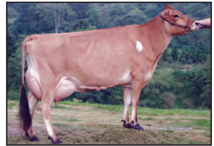
SUNSET CANYON THUNDER ANTHEM 3-ET Fourth Dam of Lot 59