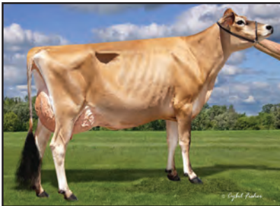
KEVETTA CHROME VIOLIN-ET Sister to the Grandam of Lot 6

BORN 07/30/2021 P7 BBR 100 FEMALE EFI 7.6% AMERICAN ID 740/740 JH1F F A1A2