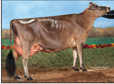
FAMILY HILL COMERICA FLAME-ET Grandam of Lot 81