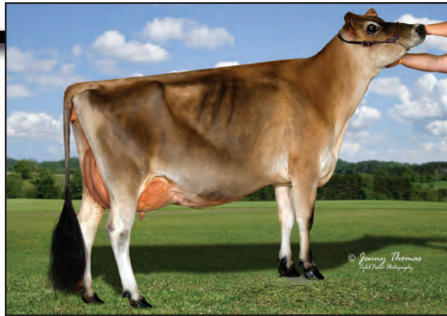
S&O GILLER RITZ BITZ, E-90% Sister to the Grandam of Lot 26