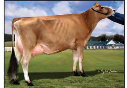
HEARTLAND SANTANA ARLENE-P-ET Sister to the Grandam of Lot 82

4TH DAM: HEARTLAND ABE AVALANCHE 91% 3-01 305 3 21820 6.9 1498 4.2 922 94DCR 3195C