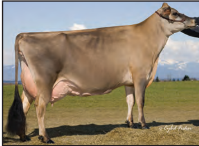
FAMILY HILL SD FAVORITE Sister to the Grandam of Lot 81