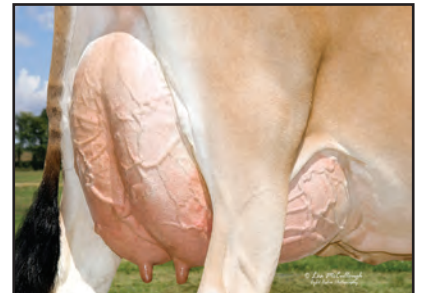
HEARTLAND ABE AVALANCHE Fourth Dam of Lot 82