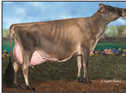
HURONIA CENTURION VERONICA 20J Fifth Dam of Lot 6