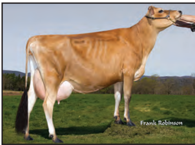
HIGH LAWN TBONE JAZZ TIME Sister to the Great-Grandam of Lot 46