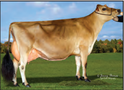
BILLINGS SULTAN BRYCE Sister to the Grandam of Lot 22

SV JADE HIRED GUN-ET USA 115093063 GT50K BBR 100 JH1F F A1A2 94JE3720 CDCB GPTA S 08/01/2023 2919DAUS 911HRDS 5%RIP 99%R -1959M 0.24% -48F 1%ILE 99%R 0.12% -49P -468CM$ -470NM$ -511FM$ -399GM$ -0.2PL -1.1LIV 3.7DPR 4.7CCR 0.9HCR 3.15SCS -0.2MFV -0.8DAB -0.1KET 1.1MAS 0.4MET 0.5RPL -3.39HTI AJCA 08/01/2023 1885DAUS GPTAT 99%R 0.2 GJUI 4.3 GJPI 99%R -92