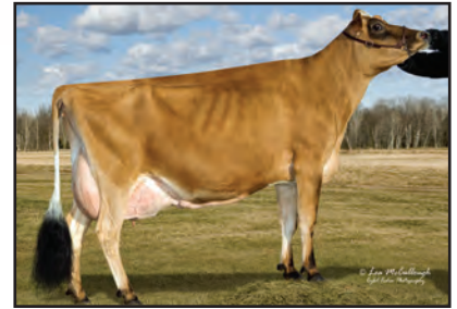
HARMONY CORNERS GRETCHEN Fourth Dam of Lot 57