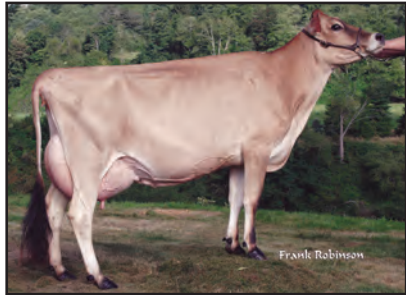
SUNSET CANYON CENTURION MAID Excellent-91% Fifth Dam of Lot 60