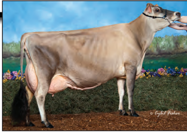
BILLINGS REMAKE BOUNTY, E-94% Fourth Dam of Lot 24