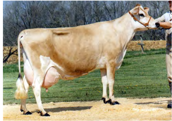
GABYS BOOMER ROXY (6), E-91% SIXTH DAM OF LOT 136