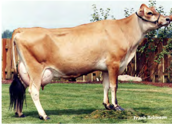
WOLF RIVER BERRETTA ADDIE-ET, E-90% SEVENTH DAM OF LOT 104