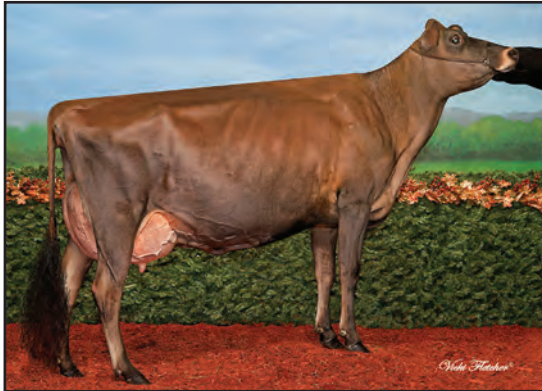
M-SIGNATURE VERBATIM TIA MARIE, VG 89 (CAN) SISTER TO DAM OF LOT 176