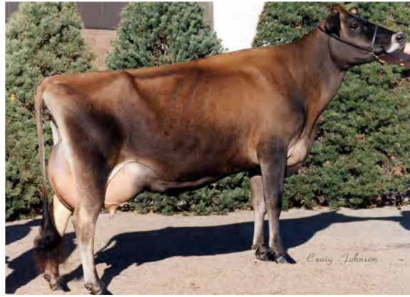
LORENS BARRIE, E-92% SIXTH DAM OF LOT 9