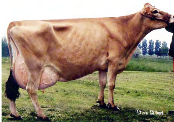
GRAZELAND BOLD DAVITA, E-91% FIFTH DAM OF LOT 64