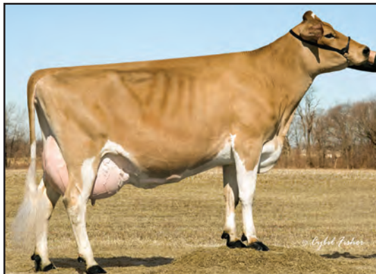
JX OOMSDALE BRAZO GRATITUDE GRACE {2}-ET, E-90% SISTER TO GRANDAM OF LOT 155