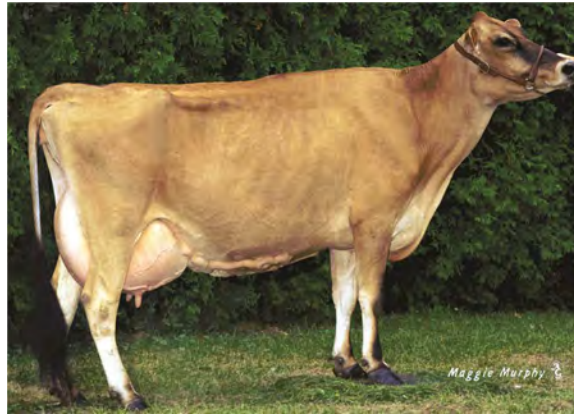
FRIENDLY VALLEY BRITA STARBRIGHT, E-92% EIGHTH DAM OF LOT 174