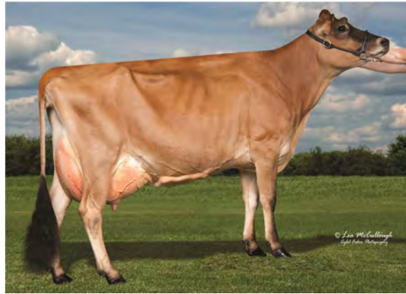
SWEET HAVEN CELEBRITY HUM V, E-92% SISTER TO GRANDAM OF LOT 137