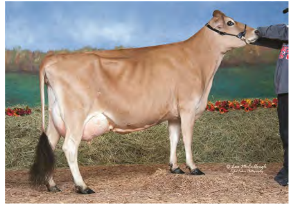
HAPPY M SHOWSTOPPIN BEAUTY {6}, VG-87% SISTER TO GRANDAM OF LOT 147