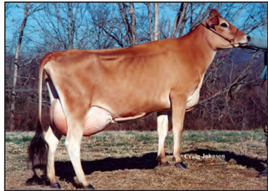
GABYS IATOLA AMETHUST-ET, E-90% SIXTH DAM OF LOT 158