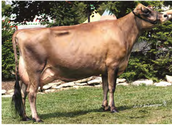
SHELL RAY REMAKE MARGO, E-93% FROM SAME FAMILY AS LOT 68