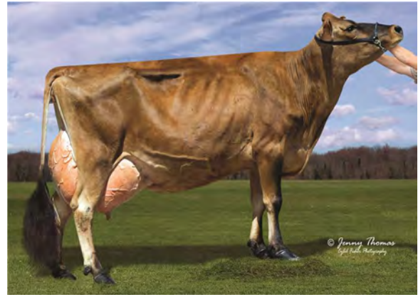
BUTTERCREST BLACKSTONE PRICELESS, E-92% GRANDAM OF LOT 70