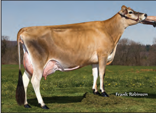
GABYS VALENTINO ANNALISA-ET, E-90% GREAT-GRANDAM OF LOT 158