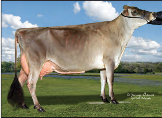
RATLIFF VERIFY RYLEE, E-92% DAM OF LOT 10