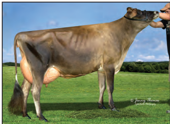
OAKFIELD MINISTER VENICE-ET, E-91% SISTER TO GRANDAM OF LOT 157