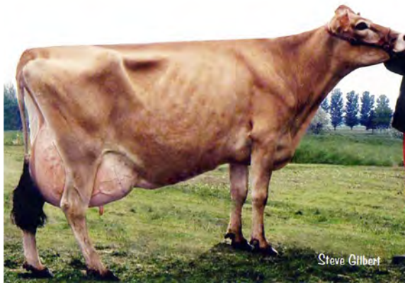
GRAZELAND BOLD DAVITA, E-91% FOURTH DAM OF LOT 61