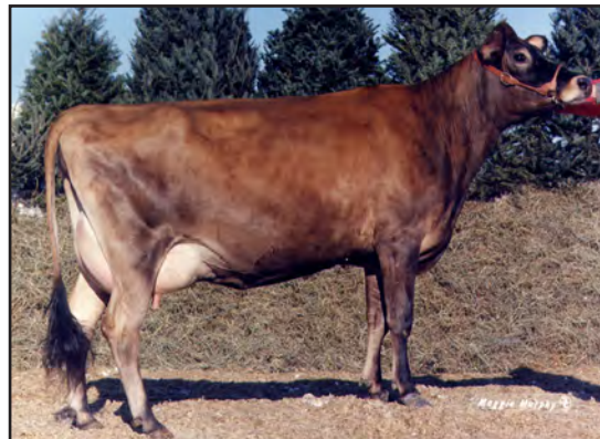
BONNYBURN REGAL TINA, VG 87 (CAN) FIFTH DAM OF LOT 176