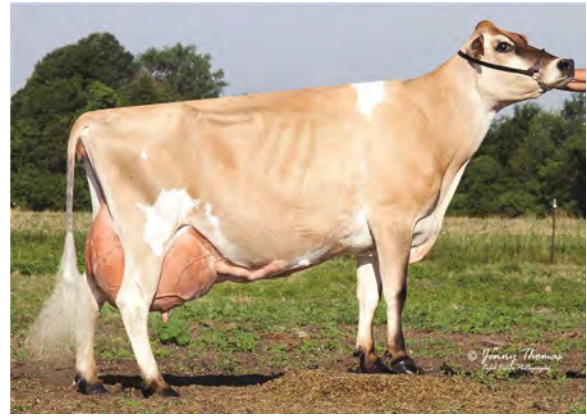
JER BEL LEGION DESTINY, E-90% FIFTH DAM OF LOT 16