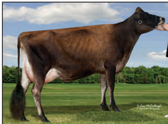
OAKFIELD TBONE VANESSA-ET, VG-81% SISTER TO GRANDAM OF LOT 157