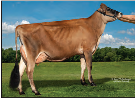
KEVETTA CELEBRITY VIVICA, VG-87% SISTER TO DAM OF LOT 157