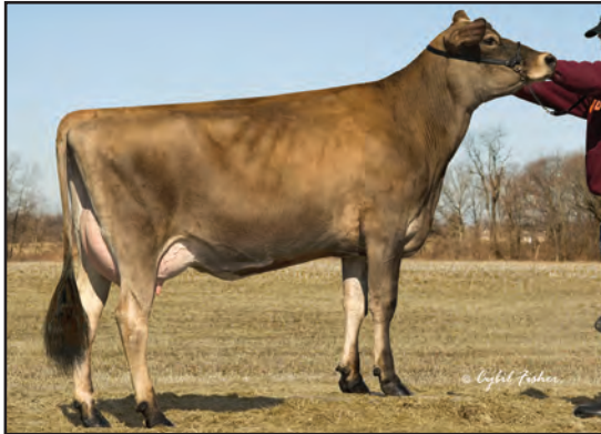
JX OOMSDALE CASEY IATOLA GARYN {3}, E-90% SISTER TO DAM OF LOT 155