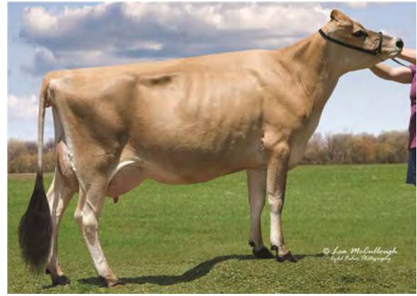
SAR CHAIRMAN ALLURE, E-94% FOURTH DAM OF LOT 175