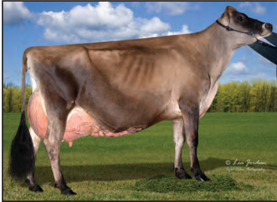
OAKFIELD TBONE VIVIANNE-ET, E-95% GRANDAM OF LOT 157