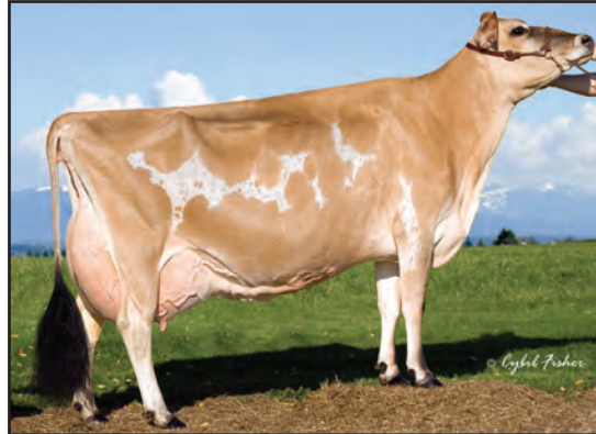
PLEASANT NOOK F PRIZE CIRCUS, E-97% FOURTH DAM OF LOT 54