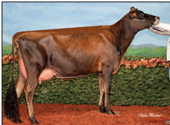
RATLIFF MINISTER RUTHIE-ET, EX 91-2E (CAN) SISTER TO GRANDAM OF LOT 10