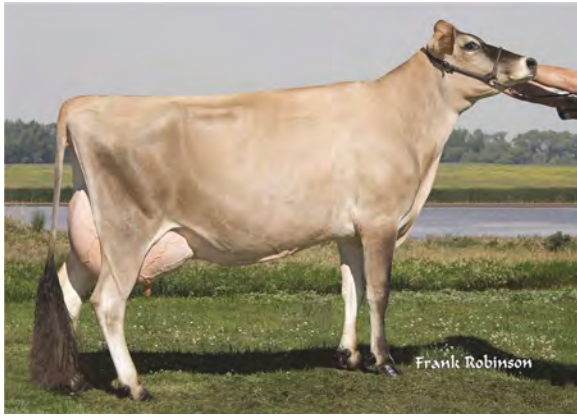
THREE VALLEYS COUNTRY MAID 3-ET, VG-85% FOURTH DAM OF LOT 164