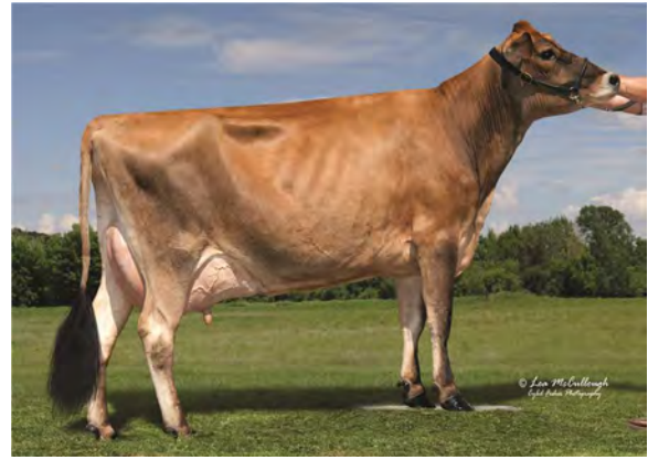
HAPPY M SOUTHERN PRIDE {5} GRANDAM OF LOT 140