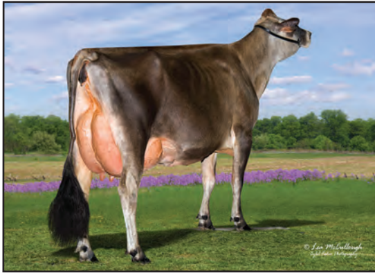
RATLIFF RES RAIZEL-ET, E-93% SISTER TO GRANDAM OF LOT 10