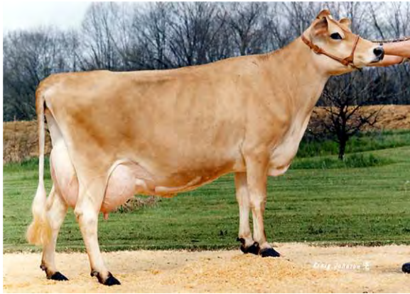
GABYS HERMITAGE ROXETTE, E-90% FIFTH DAM OF LOT 136