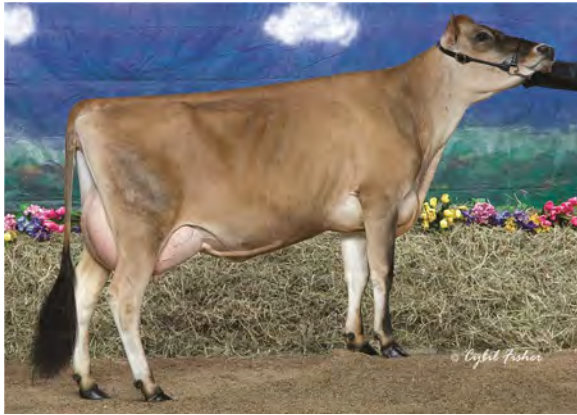
BILLINGS PERIMETER SYLVIA, E-93% GRANDAM OF LOT 153