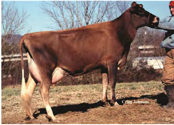
GABYS IATOLA ZIRCON-ET, E-90% FOURTH DAM OF LOT 148