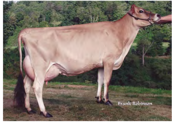
SUNSET CANYON CENTURION MAID, E-91% FIFTH DAM OF LOT 164