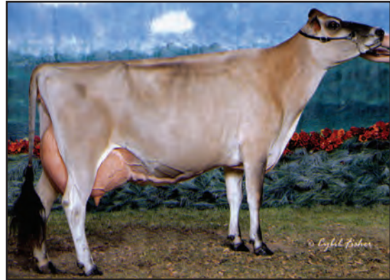
ROZEVIEV DORIE D RACHEL, E-95% GREAT-GRANDAM OF LOT 10