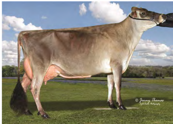
RATLIFF VERIFY RYLEE, E-92% GRANDAM OF LOT 12