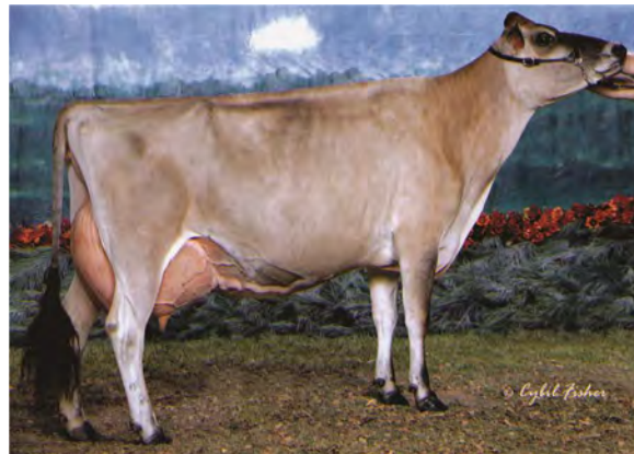
ROZEVIEV DORIE D RACHEL, E-95% FOURTH DAM OF LOT 12