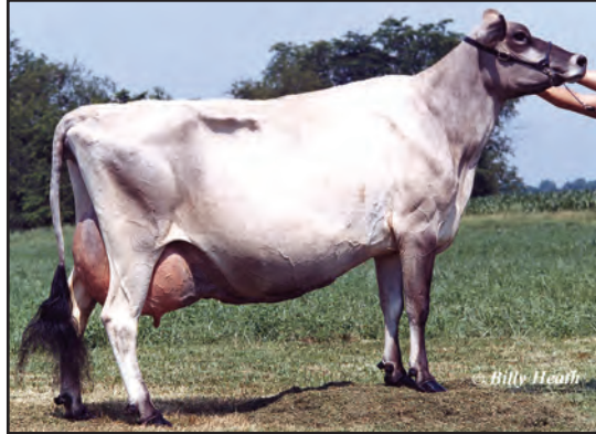
WESTER IMP INELL ISSY {5}-P, E-95% GREAT-GRANDAM OF LOT 195