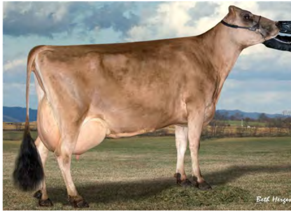
SR IMPULS MERRY, E-90% GRANDAM OF LOT 213