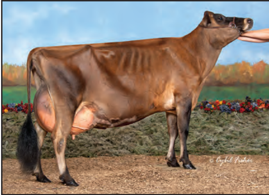
BLUE MOUNTAIN TEQUILA TINA MARIE, E-93% GRANDAM OF LOT 176