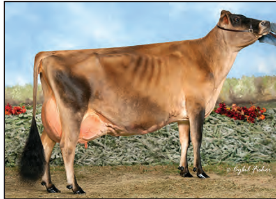
HURONIA CENTURION VERONICA 20J, E-97% FOURTH DAM OF LOT 157