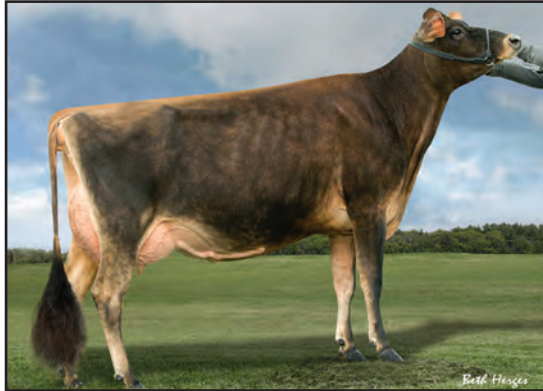
LAURICK GILLER MISSIE, E-92% SISTER TO GRANDAM OF LOT 6