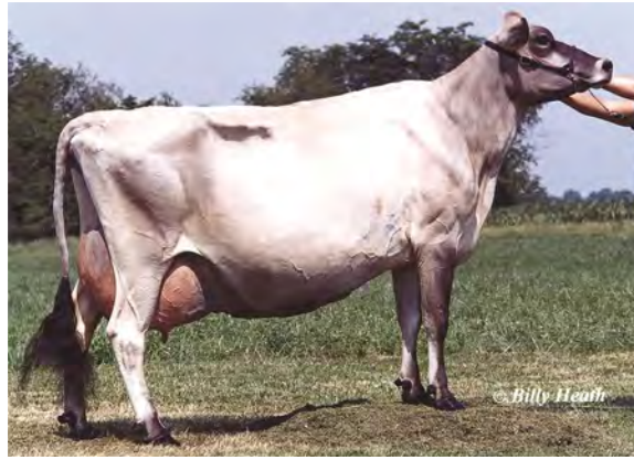
WESTER IMP INELL ISSY {5}-P, E-95% FOURTH DAM OF LOT 198