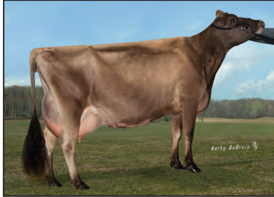
FAMILY HILL AMADEO COLBI, E-94% GREAT-GRANDAM OF LOT 54