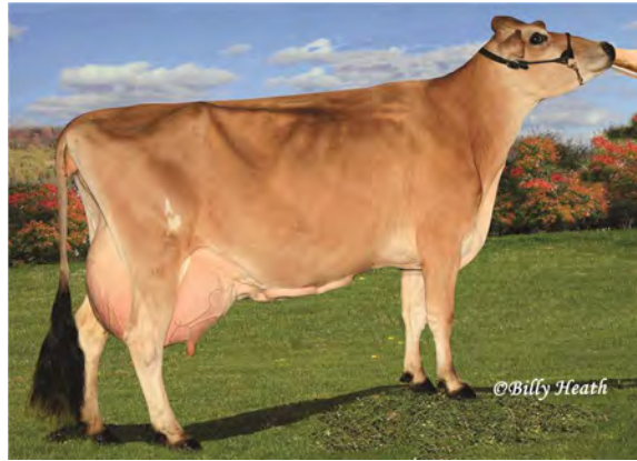
SR HALLMARK JEWEL-P, E-91% GREAT-GRANDAM OF LOT 204