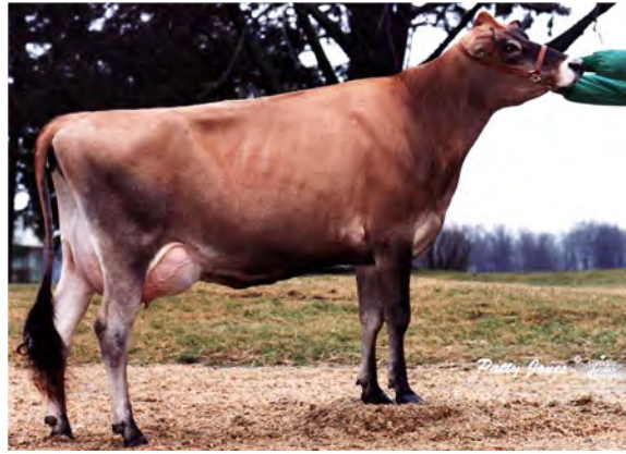
LLOLYN REN POLLYANN 3-ET, VG 87 (CAN) SIXTH DAM OF LOT 143