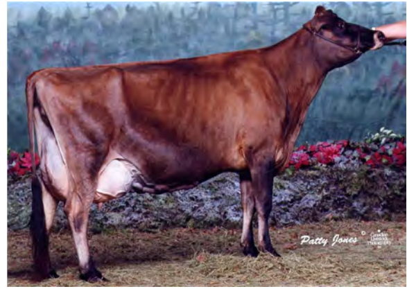
ENNISKILLEN TITLE GROVE, SUP-EX 94-3E (CAN) FIFTH DAM OF LOT 56