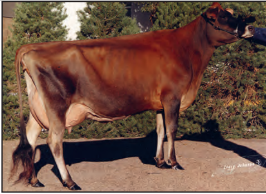
REGAL EILENE OF NETTLE CREEK-ET, E-91% SISTER TO GRANDAM OF LOT 165