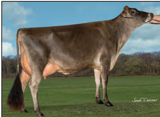
LAVON FARMS APPLEJACK CHEYENE, E-91% SISTER TO GRANDAM OF LOT 54