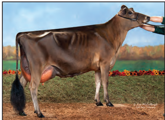
RATLIFF GOLD REGINA-ET, E-93% SISTER TO GRANDAM OF LOT 10