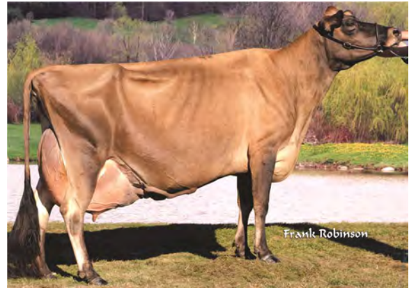
WAYMAR PATRICK NADINE, SUP-EX 97-6E (CAN) SIXTH DAM OF LOT 13