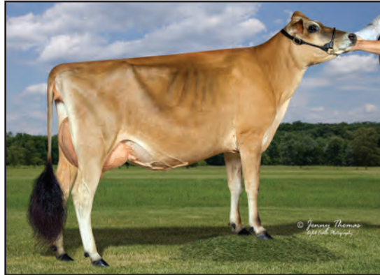
LAURICK BT MICKEY DAM OF LOT 6