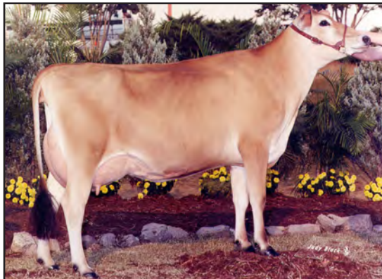
LAURICK BERRETTA CALAIS, E-94% FOURTH DAM OF LOT 6