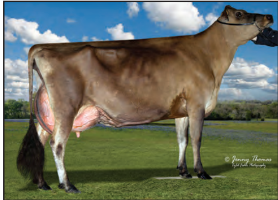
M-SIGNATURE COMERICA TIANA MARIE-ET, E-91% SISTER TO DAM OF LOT 176