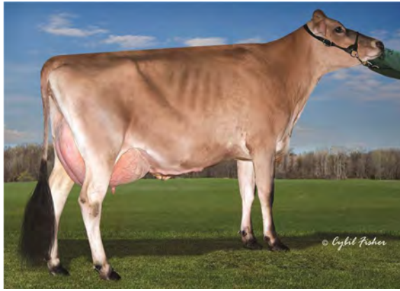
JX AMERI-MILK JUMBO SALLY 248 {5}, VG-86% DAM OF LOT 160