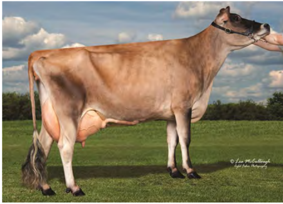
SWEET HAVEN SOUTHERN GRACE {6}, VG-85% DAM OF LOT 140