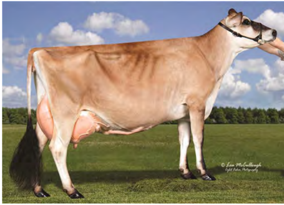
JX GABYS DONOVAN SEQUIN {4}, E-91% GRANDAM OF LOT 145