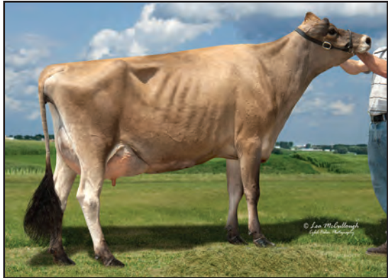
BLUE MOUNTAIN TEQUILA TAYLOR, VG-87% SISTER TO GRANDAM OF LOT 176