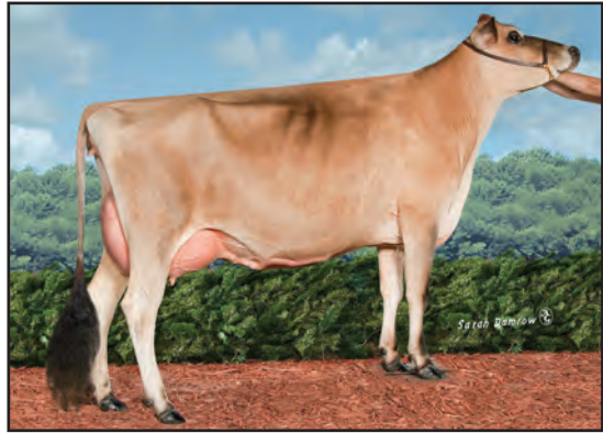
RATLIFF COMERICA REAGAN-ET, E-90% SISTER TO GRANDAM OF LOT 10