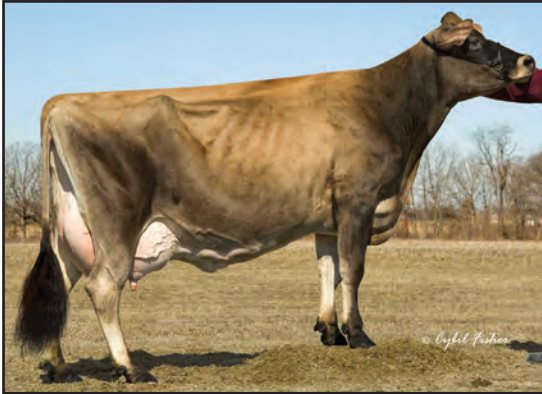
JX OOMSDALE GRATITUDE COUNTRY CASEY {2}-ET, E-90% GRANDAM OF LOT 155