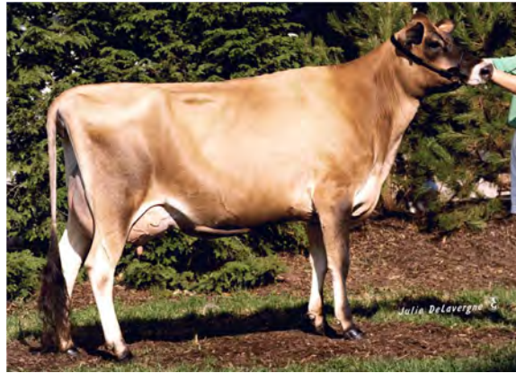
BDB GROVE PENNY FOURTH DAM OF LOT 191