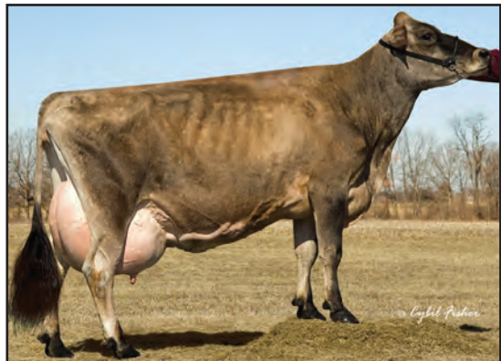
JX OOMSDALE JOHN GRATITUDE GINNY {2}-ET, VG-85% SISTER TO GRANDAM OF LOT 155