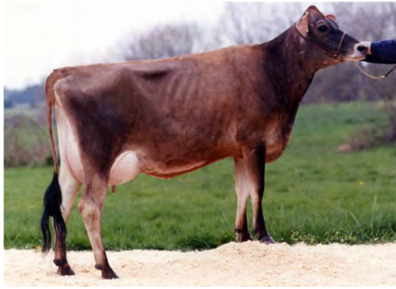
GABYS GOLDEN NATTIE, E-90% FIFTH DAM OF LOT 150