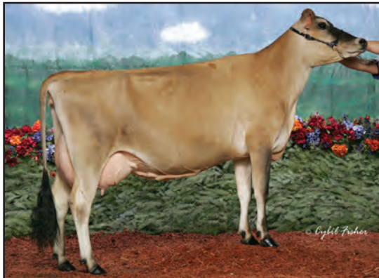
HIXSON FUTURE SLEEPY {6}-P-ET, E-94% SISTER TO GRANDAM OF LOT 195