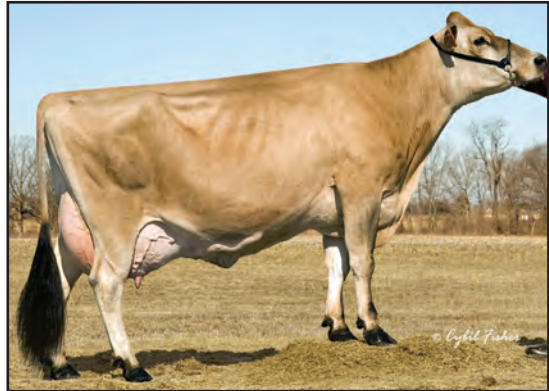
JX OOMSDALE GRATITUDE COUNTRY CC {2}-ET, E-90% SISTER TO GRANDAM OF LOT 155