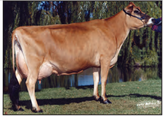
DUNCAN EILENE OF HLF, E-96% GREAT-GRANDAM OF LOT 165