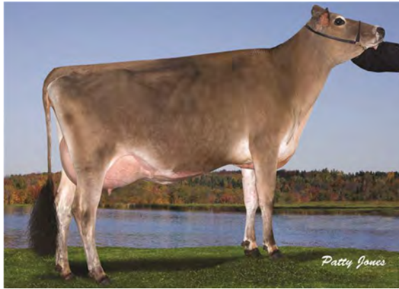
HIDDEN DREAM K JADE JETTA, VG-85% GRANDAM OF LOT 11