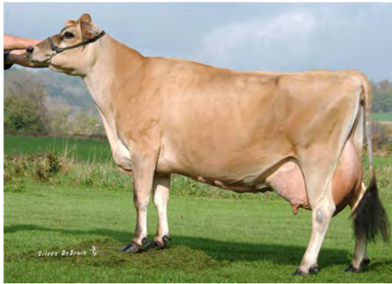
KILLIANS SAMMIE {1}, E-91% FIFTH DAM OF LOT 193