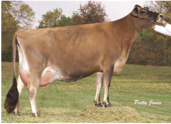
POTWELL RENAISSANCE NADIA, E-92% FIFTH DAM OF LOT 13