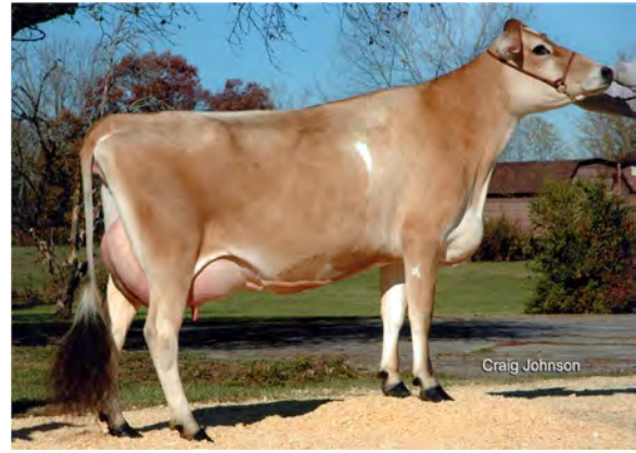
GABYS ARTIST SATIN, E-90% GREAT-GRANDAM OF LOT 145