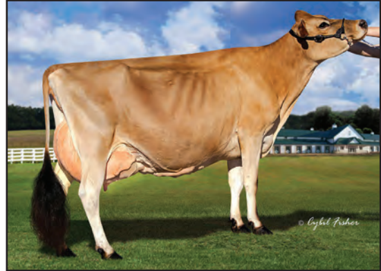
GABYS JACINTO ALYSSA, E-93% FOURTH DAM OF LOT 158