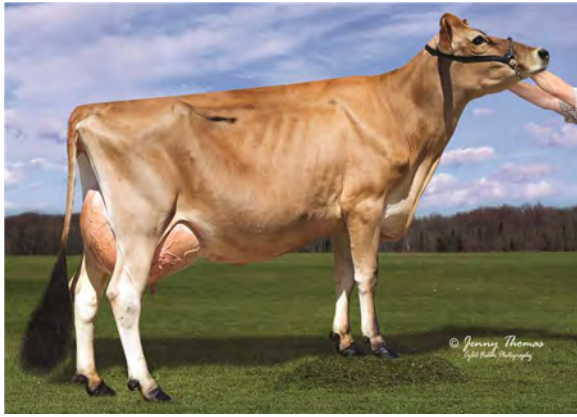
OHIO ZUMA BLACKSTON 95, E-90% DAM OF LOT 70