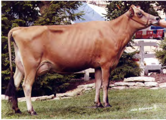
ENNISKILLEN MCT GROVE III-ET, E-93% FOURTH DAM OF LOT 56