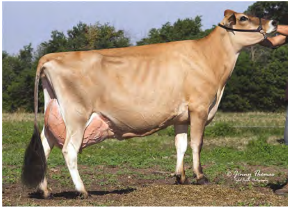
JER BEL GORDON DORA, E-91% FOURTH DAM OF LOT 16