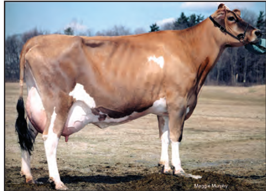
JX OOMSDALE GORDO GOLDIE GRATITUDE {1}, E-90% GREAT-GRANDAM OF LOT 155