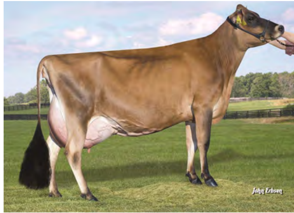
JARS OF CLAY TBONE BELLE, VG-86% GREAT-GRANDAM OF LOT 85