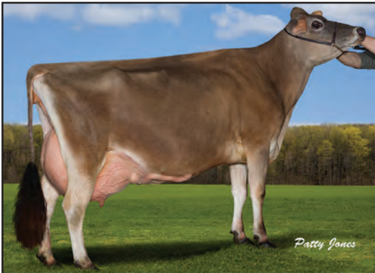
GABYS ARTIST AMBROSIA, E-94% FIFTH DAM OF LOT 158