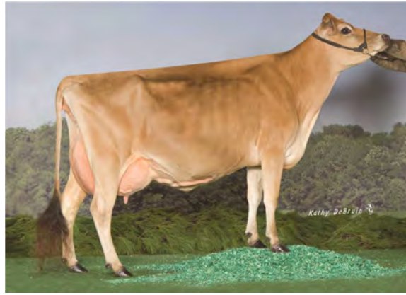
LAURICK COUNCILLER KAT, E-92% GRANDAM OF LOT 7