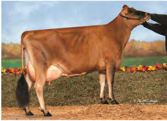
SWEET HAVEN MY FAIR LADY {6}, VG-88% GRANDAM OF LOT 147