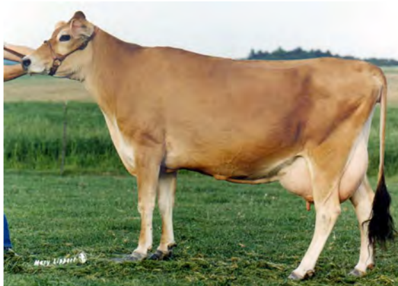
AVON ROAD TOP BRASS MEG, E-92% FIFTH DAM OF LOT 168