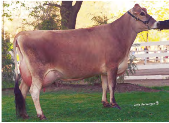
HIGHLAND JESSIES DUNCAN JUSTINE, E-92% SIXTH DAM OF LOT 188