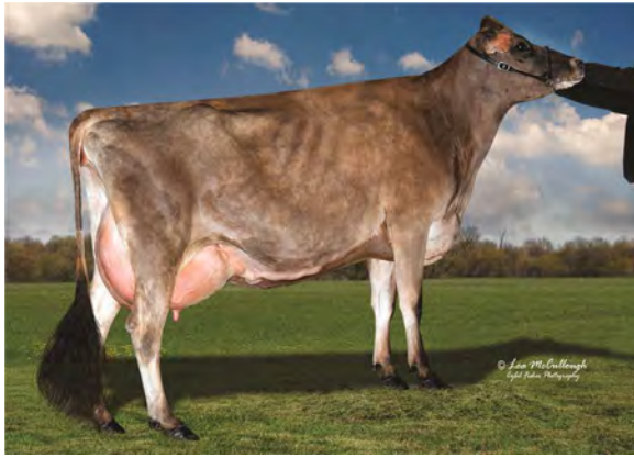
HER-MAN SHOCKER ALLEGRA-ET, E-90% GREAT-GRANDAM OF LOT 175