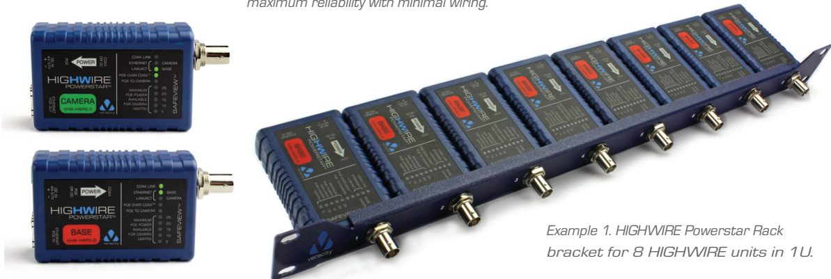
Example 1. HIGHWIRE Powerstar Rack bracket for 8 HIGHWIRE units in 1U.