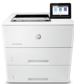
HP LaserJet Enterprise M507x