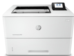
HP LaserJet Enterprise M507dn