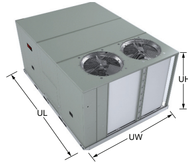
Table 6. Curb compatibility matrix - gas heat (a)