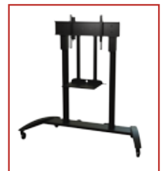
Cart with optional PN-SR763ACC1 Accessory Shelf