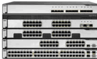
Figure 2. Cisco Catalyst 3750-24PS and Cisco Catalyst 3750-48PS Switches with IEEE 802.3af Power