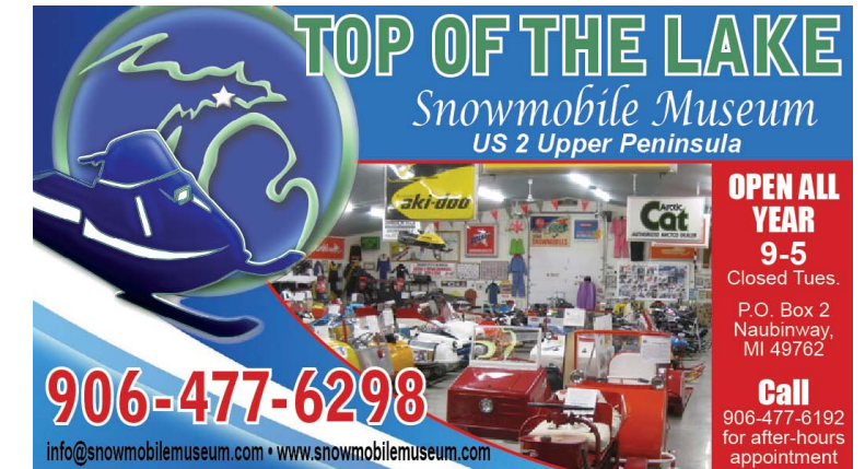
At Left: Snowmobile enthusiasts gathered to admire the collection of sleds on display at the Street Fair.

some of Michigan's top collectors. A nice breeze and thoughts of winter days ahead kept visitors coming by to study and learn about machines from a simpler time. One old guy looking at the sleds and reminiscing said it best "It was a simpler time but it was also a time when you rode all day and worked on them all night so you could ride again the next Continued on page 14