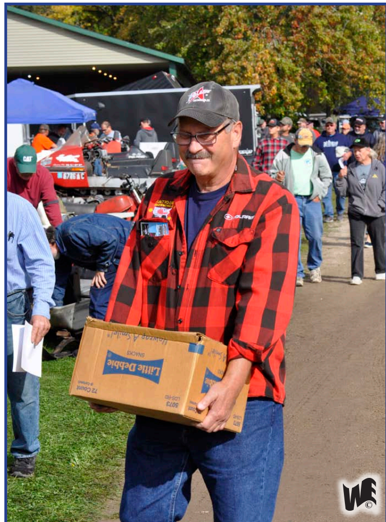
At Right: It is doubtful Little Debbie's were housed in this box. Instead much needed sleddin' goodies were probably inside.