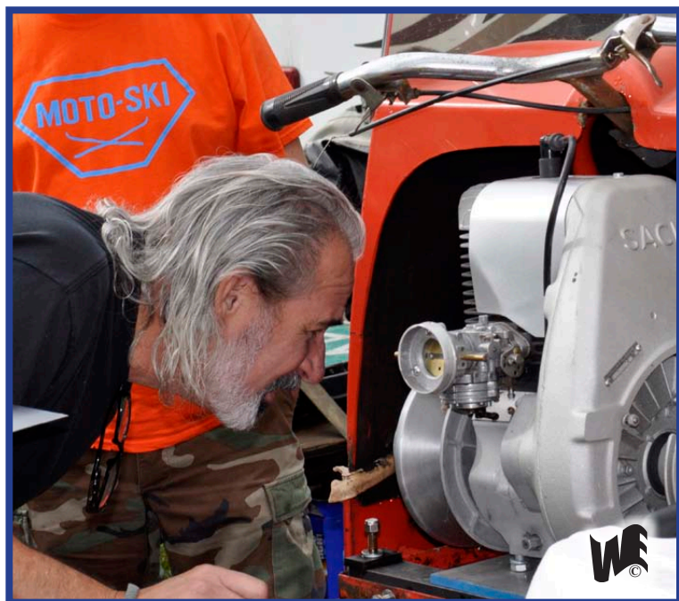
A potential buyer goes eye to eye with the carburetor on a Sachs motor as he inspects a snowmobile of interest.

Presented by the Marion Vintage Snowmobile Club Continued on page 18