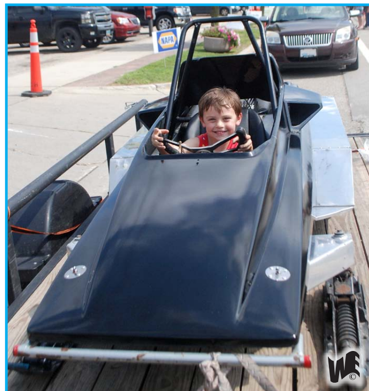
At right: A future vintage racer? This youngster couldn't resist checking out this rare Michigan made 1976 Manta Twin Track race sled on display.

The largest display since the event began, this year's selection of sleds included vintage ski-doo, Polaris, Mercury, Yamaha, an early ski-doo Elite side-by-side twin track, a unique 1976 Manta twin track race sled and other interesting machines from