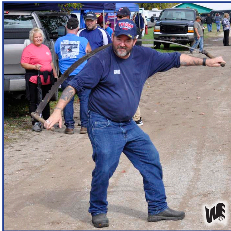
While McCulloch did make a snowmobile back in the 1960's they are best noted for their chainsaws. Since this shopper could not find the sled or the chain saw he settled for this old antique two man saw. You never know what you'll find at the swap meet.

Sales were brisk with some vendors selling out before midmorning. Parts ranging from slides to engine parts were very popular with buyers. Sleds were also moving at a decent clip with many reasonably priced 1990's and later models moving well especially with younger riders and families. Vintage sled sales continued holding their own in fact several old sleds went to kids in their teens who were looking for project or to build a reasonably