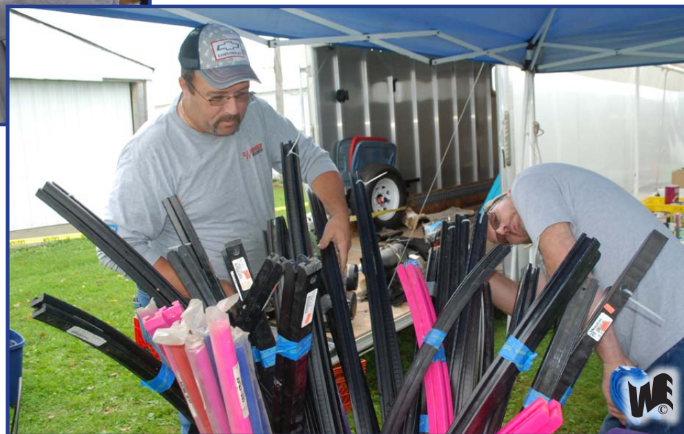
At right: Slides, Glorious slides, one vendor had a huge selection to choose from, as these to shoppers discovered.