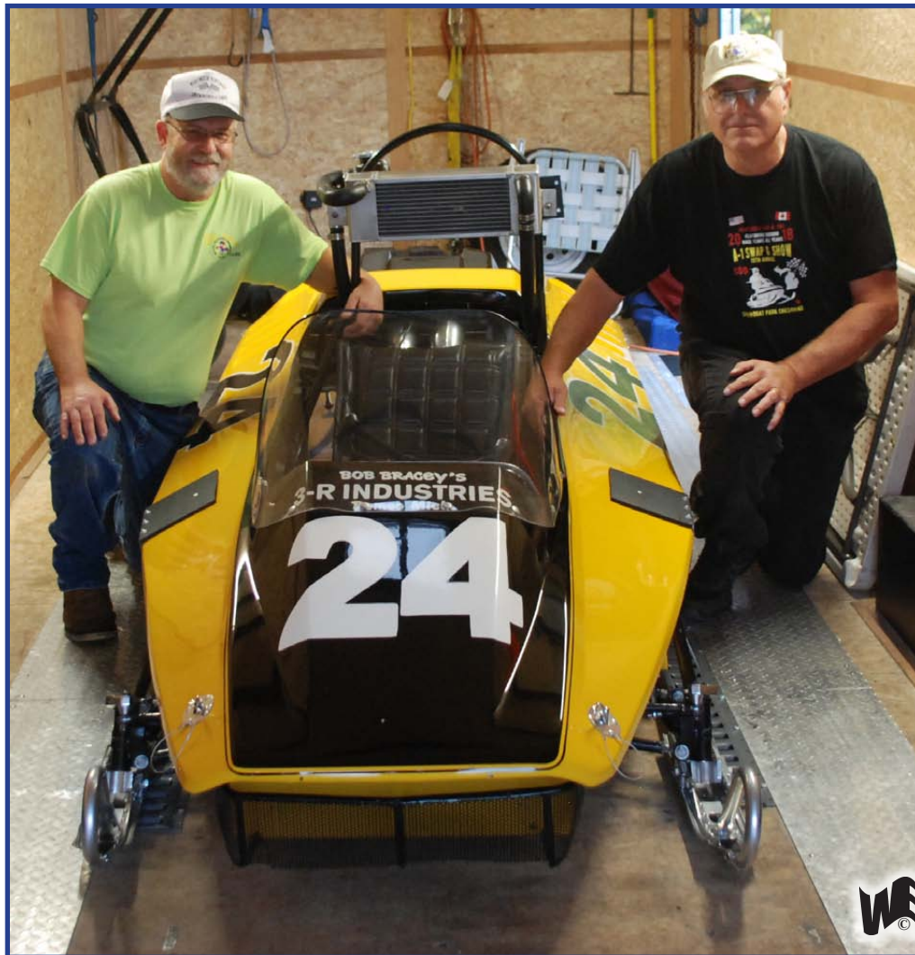
It took all out-team work and brute Strength for buyers to load this 1972 Yamaha SL 292

his recently completed one of a kind twin track Snow-Pro Manta race-sled built by 1970' /1980's to use on the oval track enduro circuit.