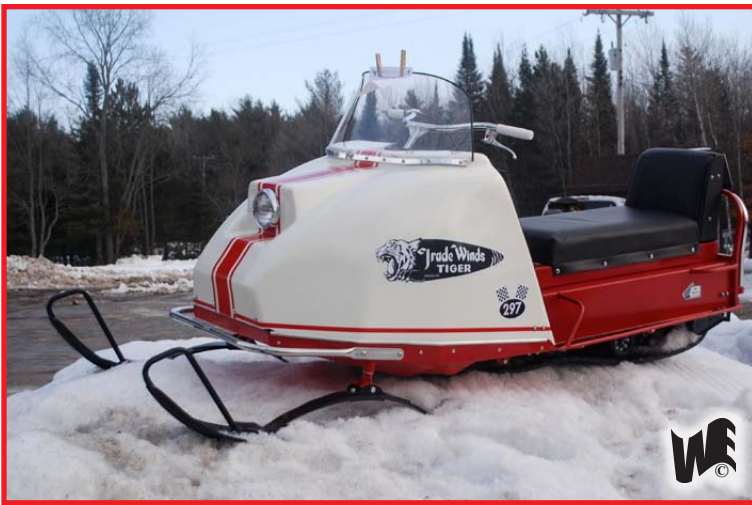
A beautifully restored Trade Winds Tiger 297 got a huge amount of attention,