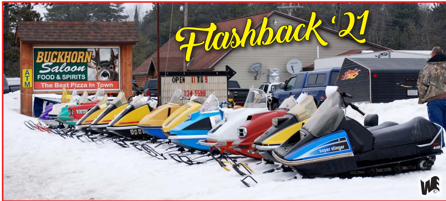
Just a small portion of the over 68 unique and common old snowmobiles on display this year.