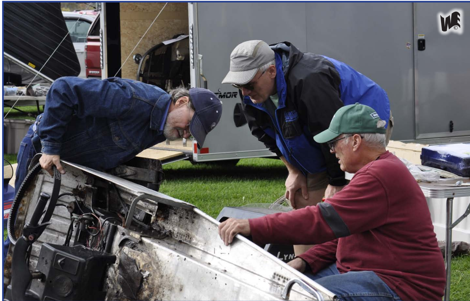
Above: To some this may look like an old chunk of junk but to these wise old sledders it might well be just the beginning of a fresh new vintage rider.

To learn more about the Marion Vintage Snowmobile Club, the Marion Snowmobile Swap Meet and the Marion Snowfest like them on Facebook; Marion Vintage Snowmobile Club or visit their Website; www.marionvintagesnowmobileclub.com