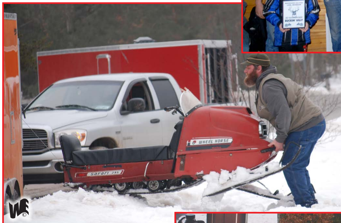
Above: Part of the fun of collecting old snowmobiles is showing and riding them. The hardest part can be loading up afterwards like this man found with his 1970 Wheel Horse Safari 295. The old ones are sure heavy!