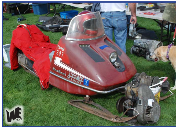
From snowsuit to engine and more this Rupp Sno-Sport package had everything you need to get a nice rider or show sled ready to go.