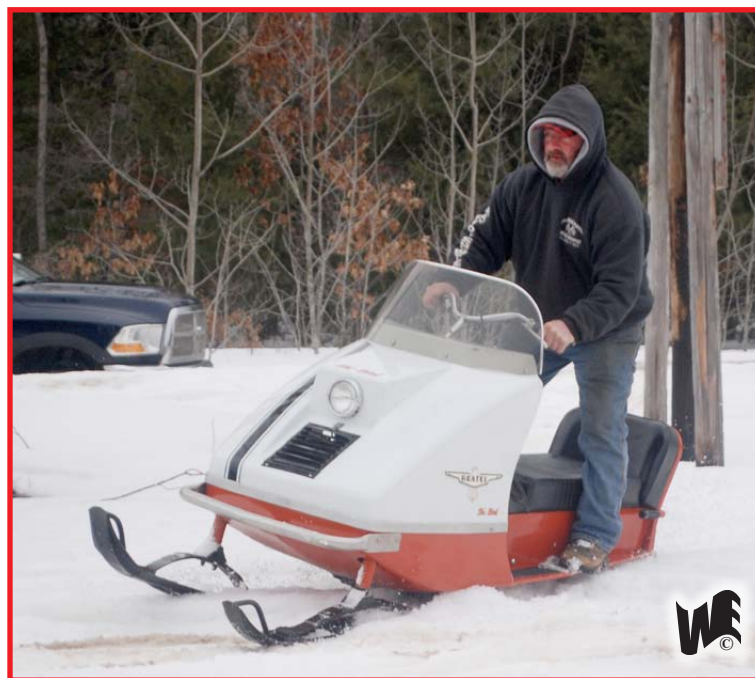
Nothing beats seeing snowmobile history in motion especially when it's an odd make like this 1967 Boatel Ski-Bird on display this year with many other odd and common makes.

Lake, Michigan –February 28, 2021; -- The winter of 2020/2021 was looking pretty bleak months before it even started. Cancellations due to COVID-19 concerns had many area events like the Marion Snowfest pulling the plug long before the first flake