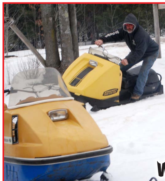
At Left: A StarCraft Snow Star 290 kicks makes its way to parking place along side an equally unique Sno-Prince.