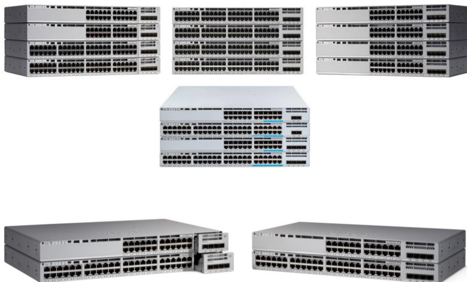
Figure 1. Cisco Catalyst 9200 Series switches

The Cisco Catalyst 9200 Series is made up of modular (C9200) and fixed (C9200L) switch models.