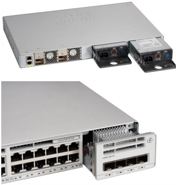
Figure 3. Cisco Catalyst 9200 Series Switch dual redundant power supplies

Table 4 lists the PoE power availability for each model.