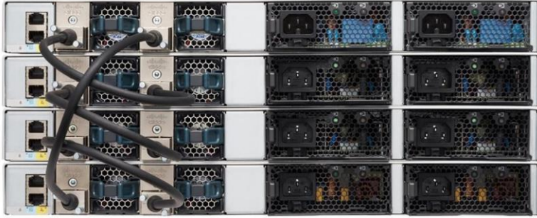
Figure 4. Cisco Catalyst 9200 Series Switch stacked units