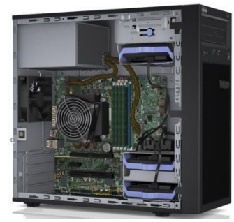
3D Tour: ThinkSystem ST50 Server ST50 Product Guide