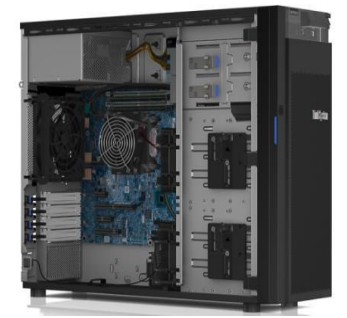
3D Tour: ThinkSystem ST250 Server ST250 Product Guide

*Pricing below is estimated end street pricing after promotions are applied. Contact your Authorized Lenovo Partner for an official pricing quote.