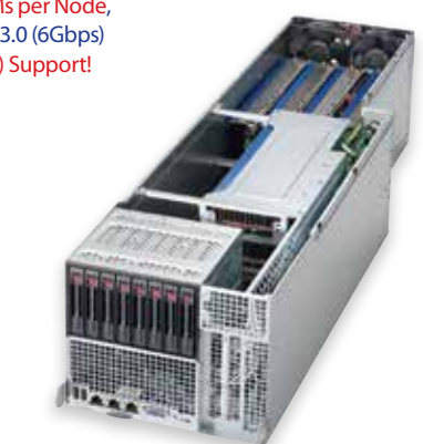
Up to 8x 2.5" HDDs per Node