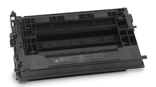
HP 37A Black LaserJet Toner Cartridge