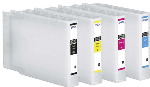
748 DURABrite® Pro Series Genuine Epson® initial ink cartridges 1

Printer designed for use exclusively with Epson Ink cartridges*.