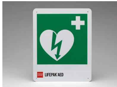
Flat ILCOR Location Sign 11998-000327 (w/logo, 20.3 cm x 25.4 cm)