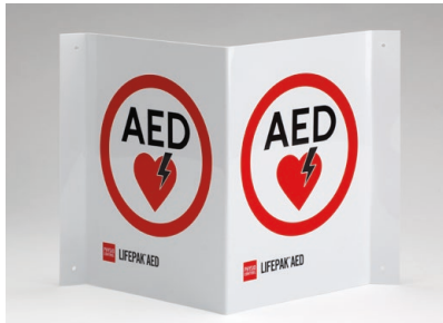
Tent AED Location Sign 11998-000332 (w/logo, 17.8 cm x 20.3 cm)