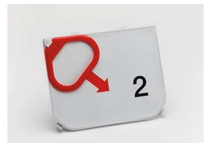
Replacement Electrode Tray Cover 11250-000139