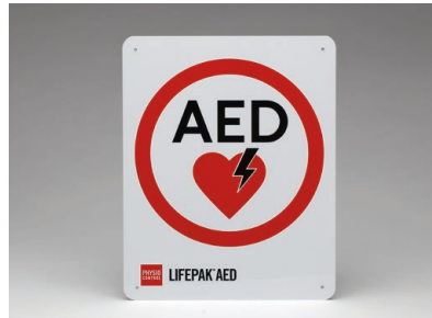
Flat AED Location Sign 11998-000330 (w/logo, 20.3 cm x 25.4 cm)