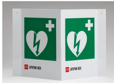
Tent ILCOR Location Sign 11998-000329 (w/logo, 17.8 cm x 20.3 cm)