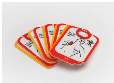
Training Electrode Set Includes 5 sets of pads. 11250-000140