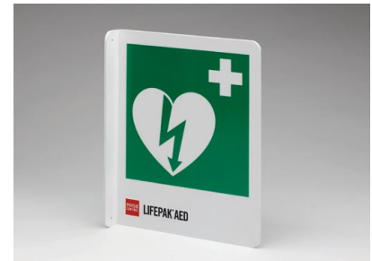
T-mount ILCOR Location Sign 11998-000328 (w/logo, 20.3 cm x 25.4 cm)