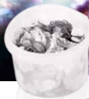
SILVER SHELLS table confetti