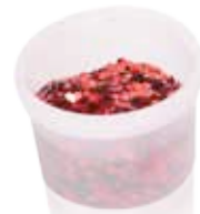
RED HEART table confetti