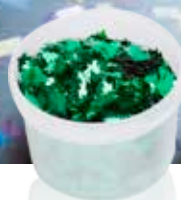
GREEN CHRISTMAS tree table confetti