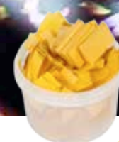
PAPER AND METALLIC SLOW FALL CONFETTI