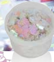
WHITE OPALESCENT snowman table confetti