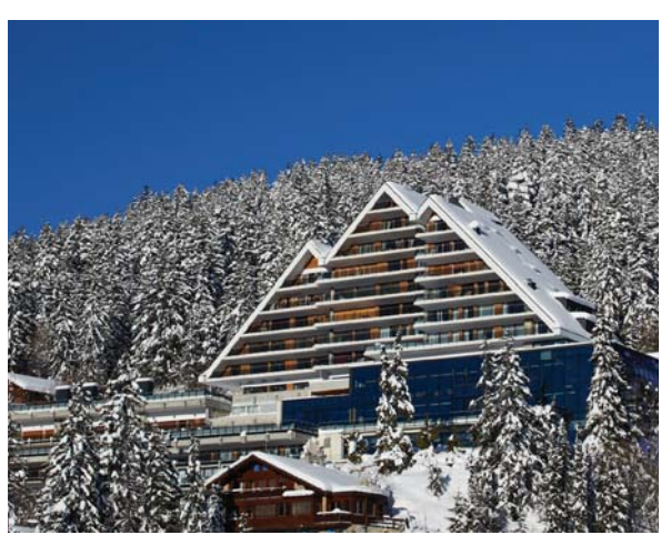
The hotel's roof was inspired by the shape of the peaks surrounding it

Some personalised programmes to intensify the beneficial effects of the mountains will be starting in Q3 of 2014. The hotel is themed around wellness and focuses on the concept of