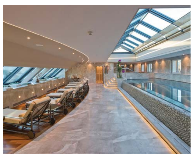
The Spa Mont Blanc has opened following a three-year long renovation

Spa Mont Blanc will offer ESPA and Swiss Perfection treatments, combining purity with an authentic Swiss experience. The new spa brand will also offer a range of signature and locally-inspired therapies focused on both body and mind, with holistic and therapeutic treatments designed to have lasting benefits.