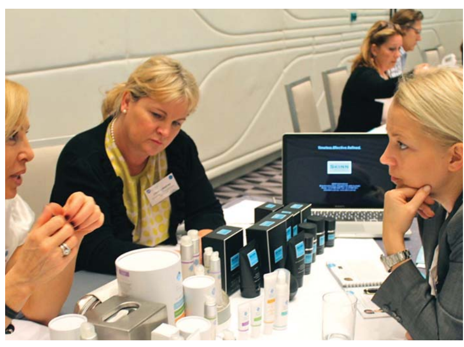
Spameeting Autumn Middle East, India & Russia will be held 27-28 November at the Meydan Hotel, Dubai

Wyboston Lakes, Bedfordshire, UK Spa Life exposes spa professionals to new product innovations; industry insights; networking opportunities; and quality