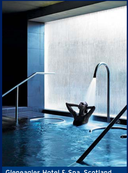
Gleneagles Hotel & Spa, Scotland