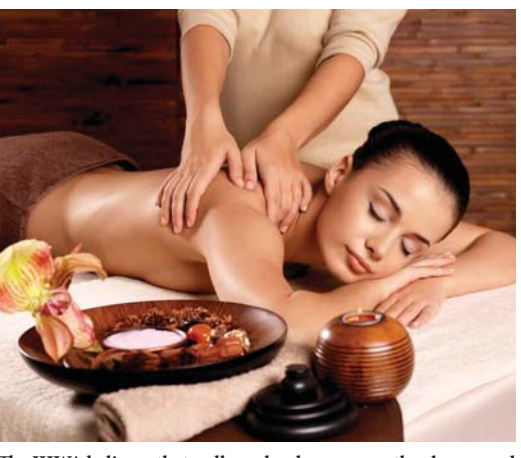
The IHWA believes that wellness has become another buzz word

Read Spa Opportunities online: www.spaopportunities.com/digital