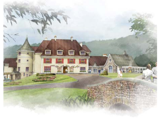
The destination spa has been designed with a French country estate theme

Spa Mirbeau will also house a central resting area with a heated foot pool and an outdoor terrace with a heated pool and bar area. In addition the spa will feature a fitness centre