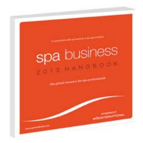
The Spa Business Handbook is available now