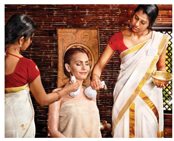
IISRM is teaming up with KSWDC to bring India a spa qualification

KSWDC seeks to bring women out of binding normative structures by making them