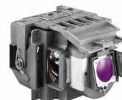
SU931 : 5J.JEH05.001