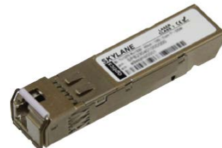
Figure 1. SFP+ Single Fiber (non-binding illustration)