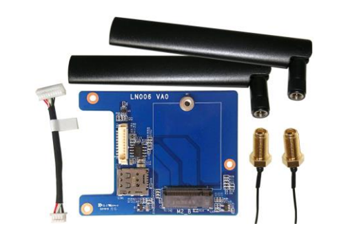
Note: M.2-LTE card and SIM card are not included.

LTE adapter kit for the 2.5" bay including two external LTE antennas