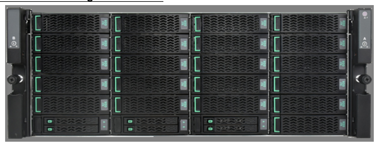
HPE Nimble Storage Adaptive Flash Array<sup>3</sup> (Base array, 4U; 21 bays hold carriers with Large Form Factor HDDs, 3 bays hold Dual Flash Carriers with Small Form Factor SSDs)

https://www.hpe.com/us/en/storage/nimble.html.