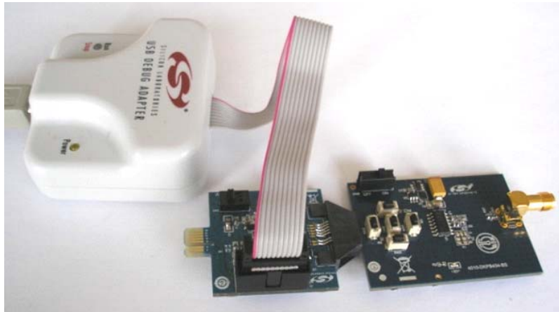
Figure 9. Target Board and Debug Adapter

The target board is connected to a PC running the Silicon Laboratories IDE via the USB Debug Adapter as shown in Figure 9.