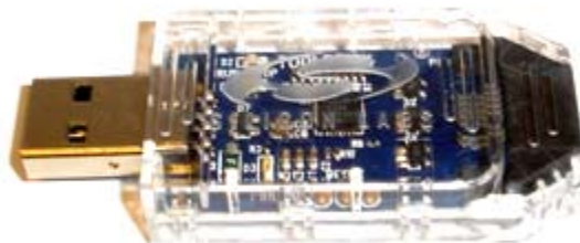
Figure 8. Toolstick Base Adapter (P/N Toolstick_BA)