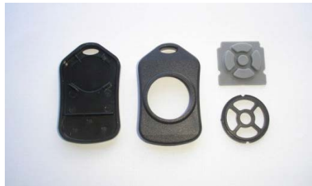
Figure 6. Key Fob Plastic Case (Translucent Grey) (P/N MSC-PLPB_1)