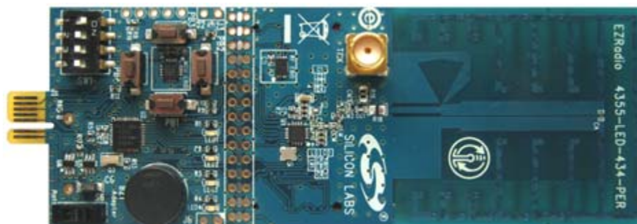
Figure 4. Si4355 RFStick 434 MHz Receiver Board (P/N 4355-LED-434-SRX)

Note: Instead of this board, the 434 MHz development kits may contain the pcb antenna version of this board called the Si4010 key fob development board 434 MHz (P/N 4010-DKPB_434).