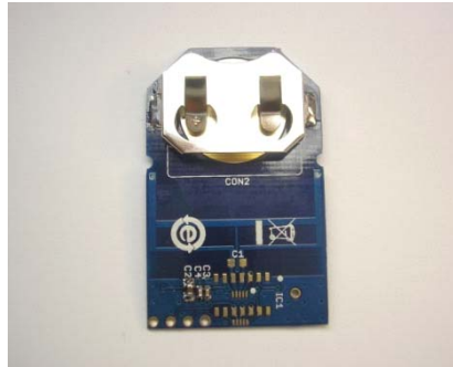
Figure 5. 4010 Key Fob Demo Board 434 MHz w/o IC (P/N 4010-KFOB-434-NF)