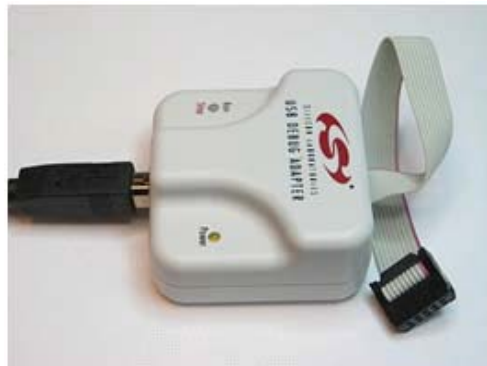
Figure 7. EC3 Debug Adapter (P/N EC3)