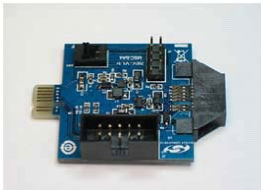
Figure 1. Burning Adapter Board (P/N MSC-BA4)