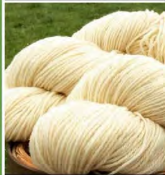
EVIES FLOCK YARN

Proud to have won the beautiful SSBA Hardwicke Perpetual Challenge Cup 2015 for 'Most Prolific Ewe' - with one of our original sheep 'Barb' - she truly is a brilliant mother, with 10 registered daughters, still on the farm - all excellent mothers too - & granddaughters now too!