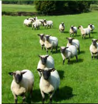
STOCK FOR SALE