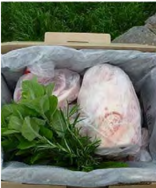
LAMB BOX ORDERS