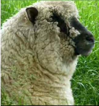
OUR 'EVIE' ❤️