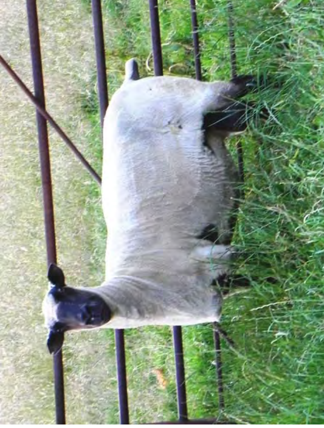
BB158C – Most prolific ewe 2014 – Dam of Hayne Oak Nelson