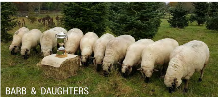
BARB & DAUGHTERS

Proud to have won the beautiful SSBA Hardwicke Perpetual Challenge Cup 2015 for 'Most Prolific Ewe' - with one of our original sheep 'Barb' - she truly is a brilliant mother, with 10 registered daughters, still on the farm - all excellent mothers too - & granddaughters now too!