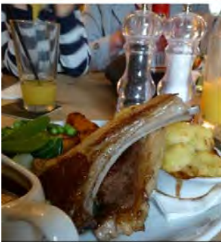
ON THE MENU