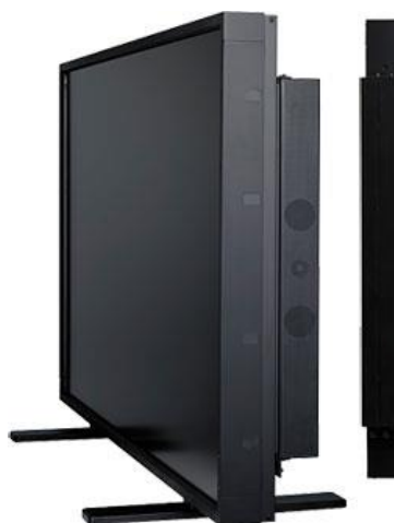
SP-RM1 front/side view