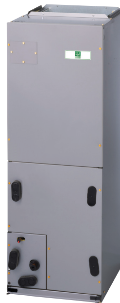
FJM4 Fan Coil