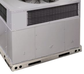
PGD4 - Representative model only, some models may vary in appearance.

# G = 1-phase series, E = 3-phase series