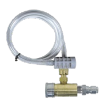
Part No. BCNH400001