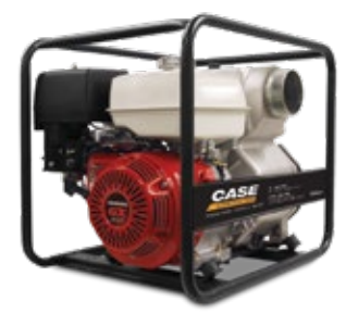
Part No. MCCEW413HT