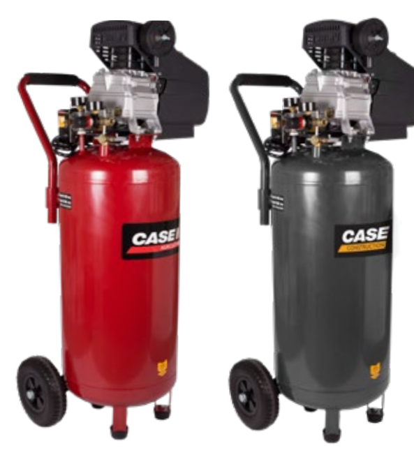
Part No. BCAC2020