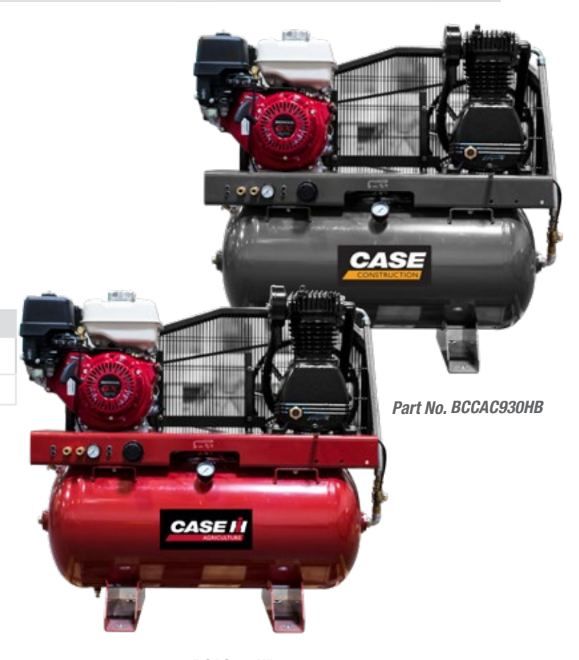
Part No. BCAC930HB