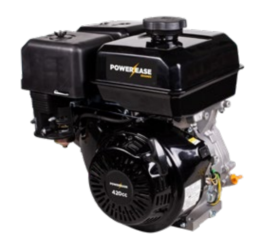
Part No. MC150ENG