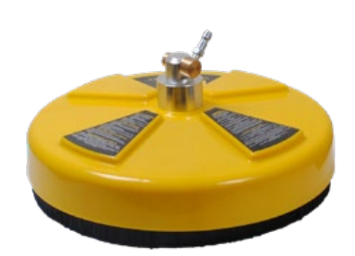
Part No. MCNH403014