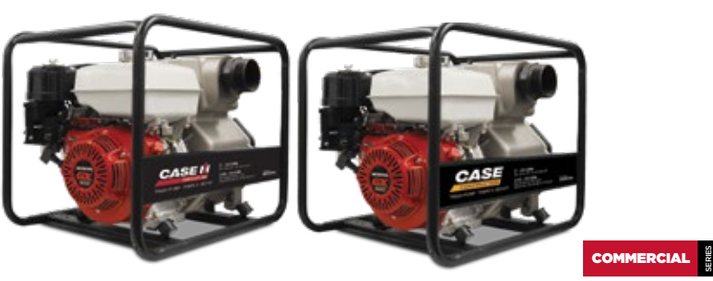
Part No. MCW313HT