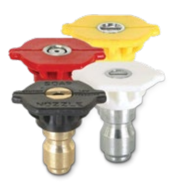
Part No. MCNH210030