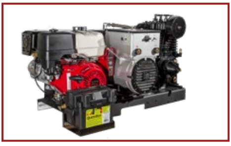
Skid Mount Option - Part No. BCAC1330HGWB