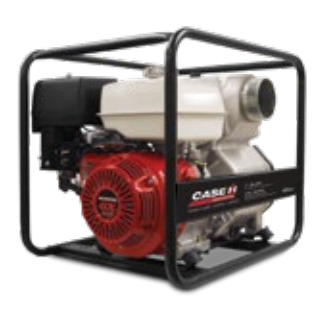
Part No. MCW413HT