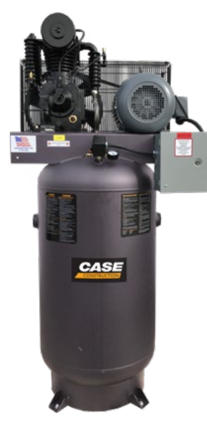
Part No. BCCEAC7580B