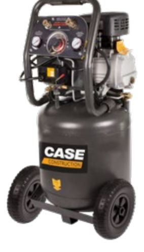
Part No. BCCEAC2010