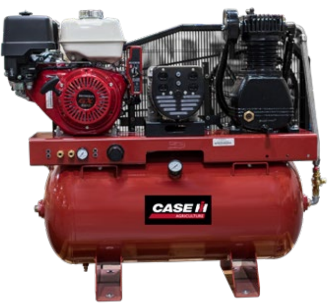
Part No. BCAC1330HG2