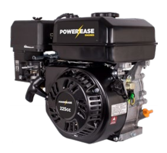
Part No. MC070ENG