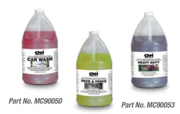
Part No. MC90052