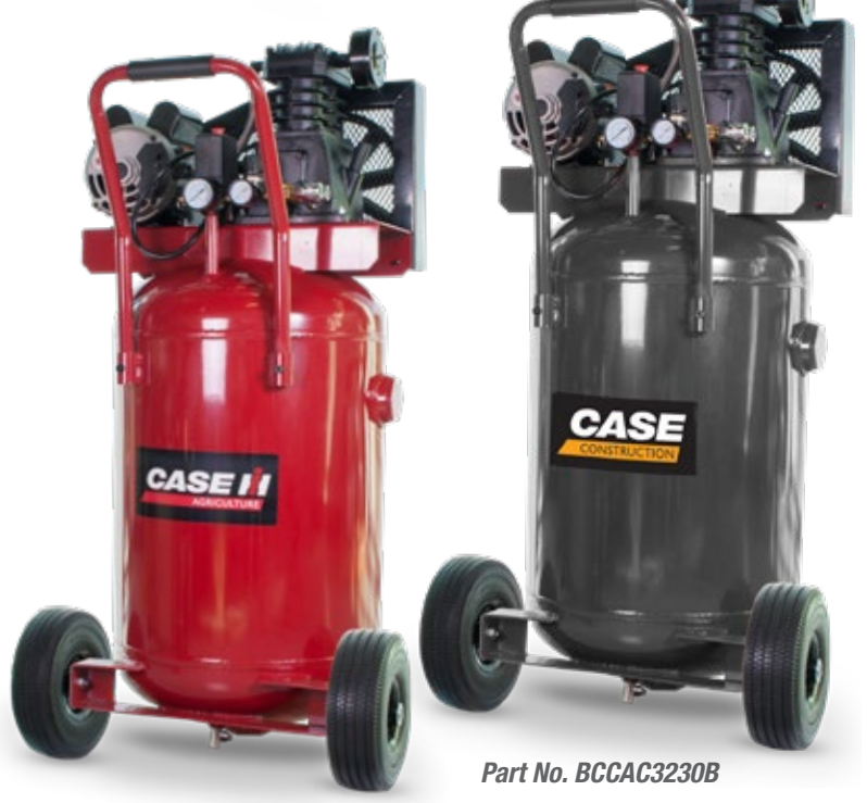
Part No. BCAC3230B