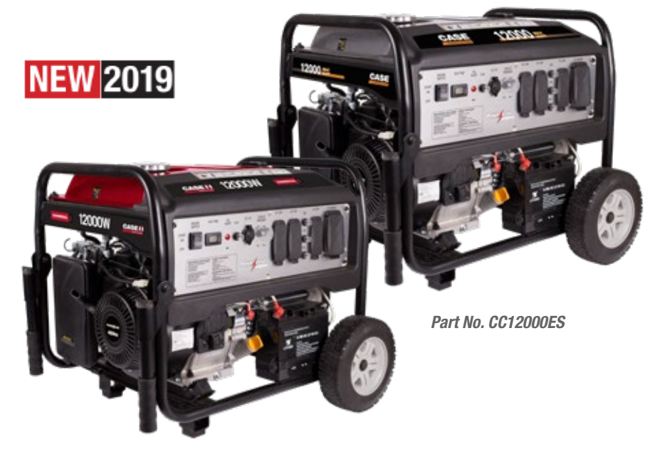
Part No. C12000ES