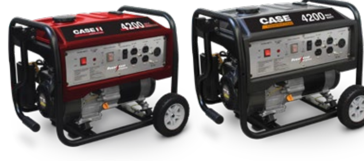
Part No. BC4200PS