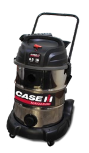
Part No. BCV6516

PN: 19-3102 — Disposable Vacuum Bags (3 pack) PN: 08-2566B - Filter Cartridge with Cap