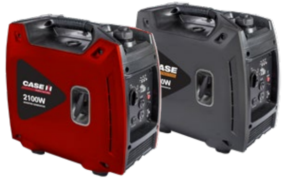
Part No. C2100IG