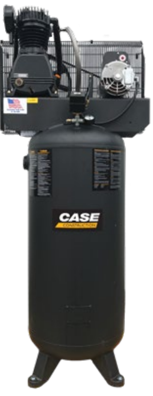
Part No. BCCEAC5080B