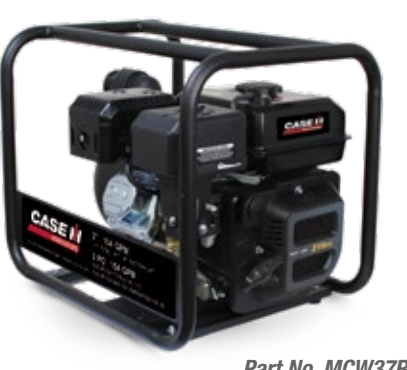
Part No. MCW37RN