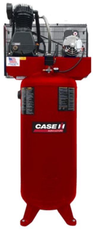
Part No. BCAC5080B