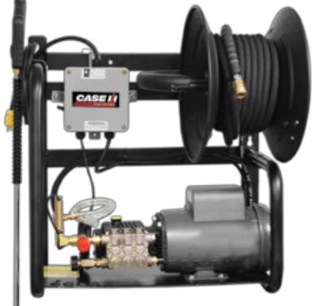
Part No. BC1520BWH