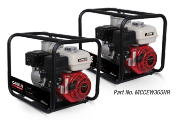
Part No. MCW365HR