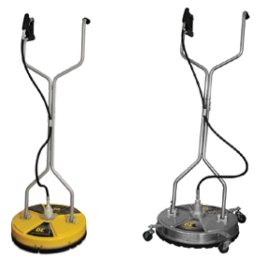
Part No. BCNH403003