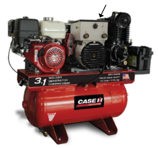
Part No. BCAC1330HGW