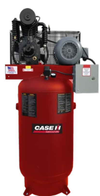
Part No. BCAC7580B