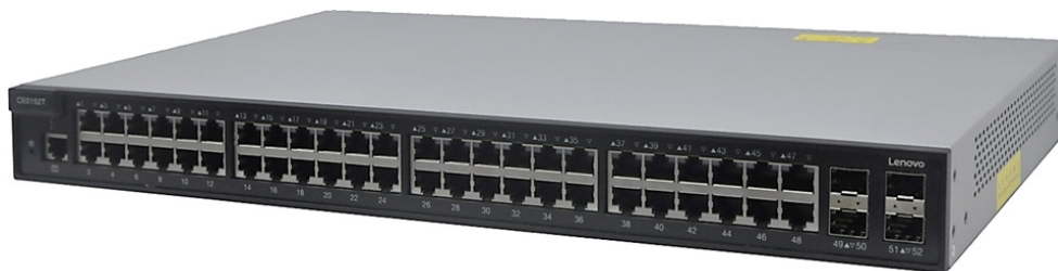
Figure 1. Lenovo CE0152T Switch

The Lenovo CE0152T Switch is shown in the following figure.