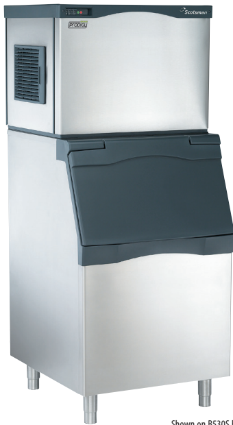
Shown on B530S bin.