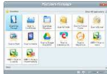
*Quick Menu for Mac OS features other applications