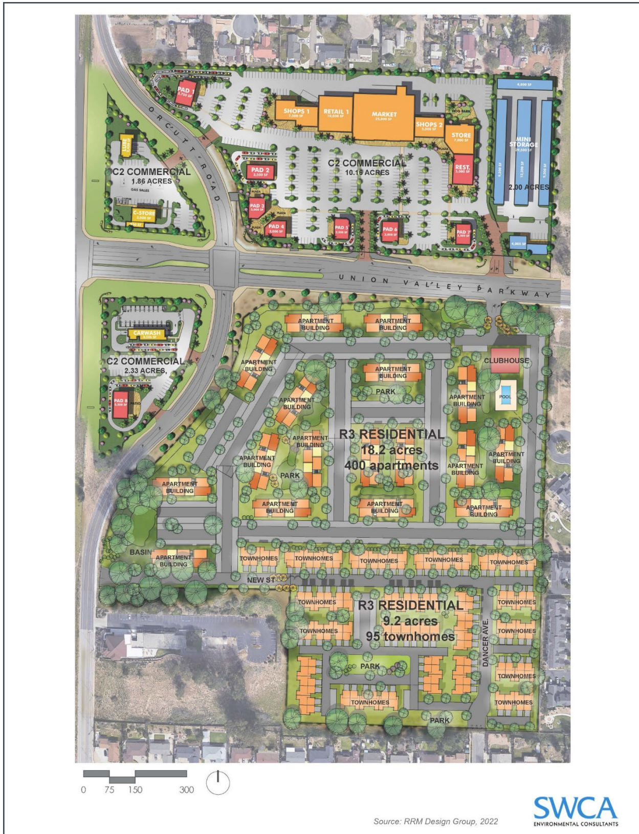
Figure 2-3. Conceptual development plan.