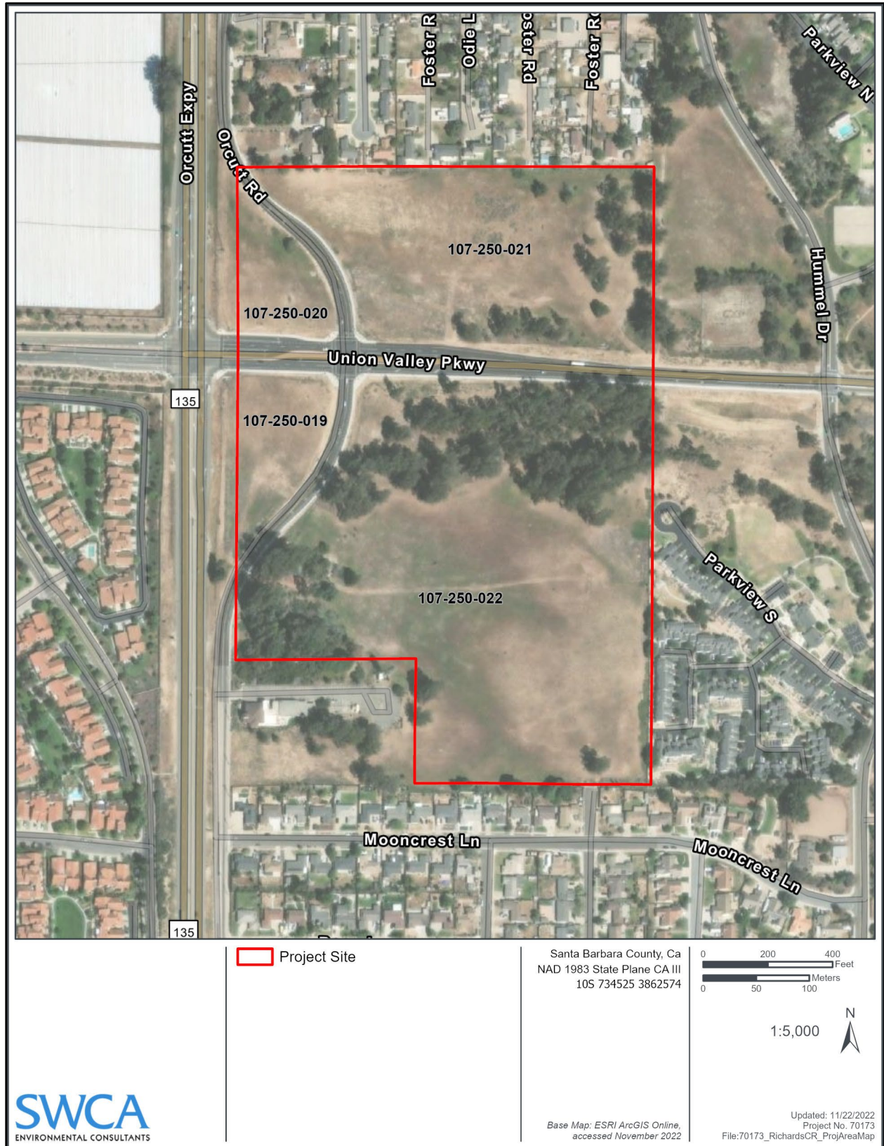
Figure 2-2. Project location.