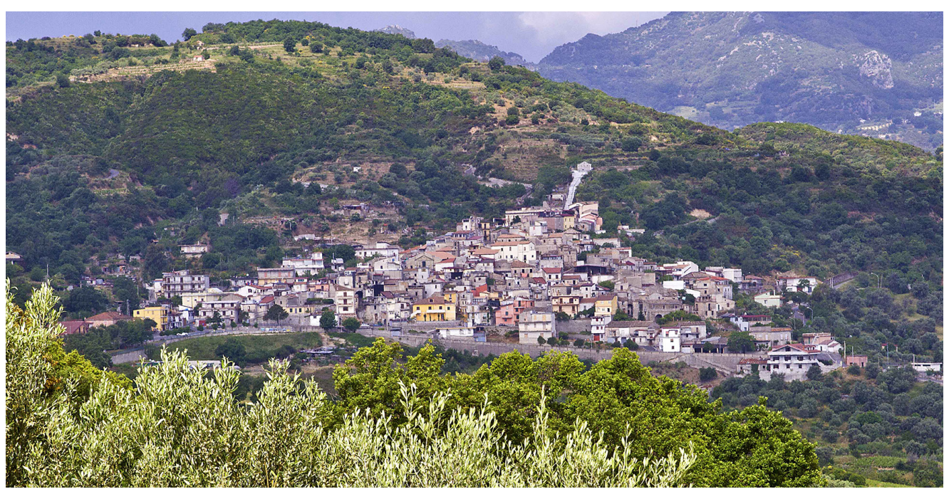
Camini (RC) - Italy | Photo © Celestino Gagliardi

The transnational activities of the project will take