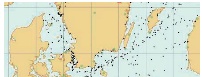
Plot from a flight test with Swedish military surveillance aircraft FSR890 at altitude 6000 m.