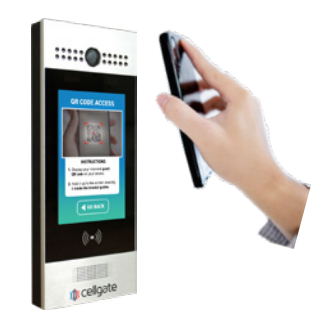
QR CODE VISITOR MANAGEMENT