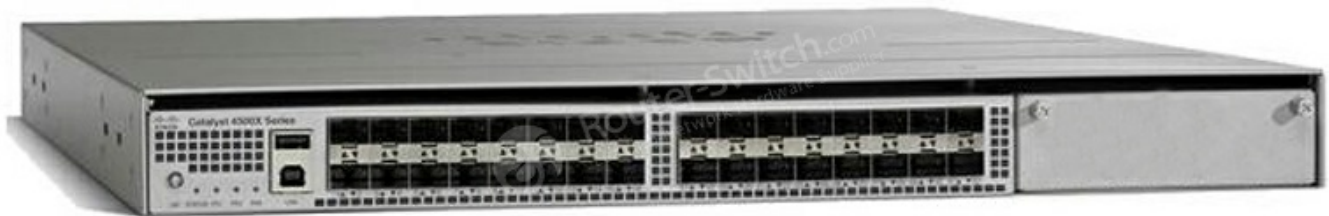
Table 1 shows the Quick Specs.

Figure 1 shows the appearance of WS-C4500X-32SFP+.