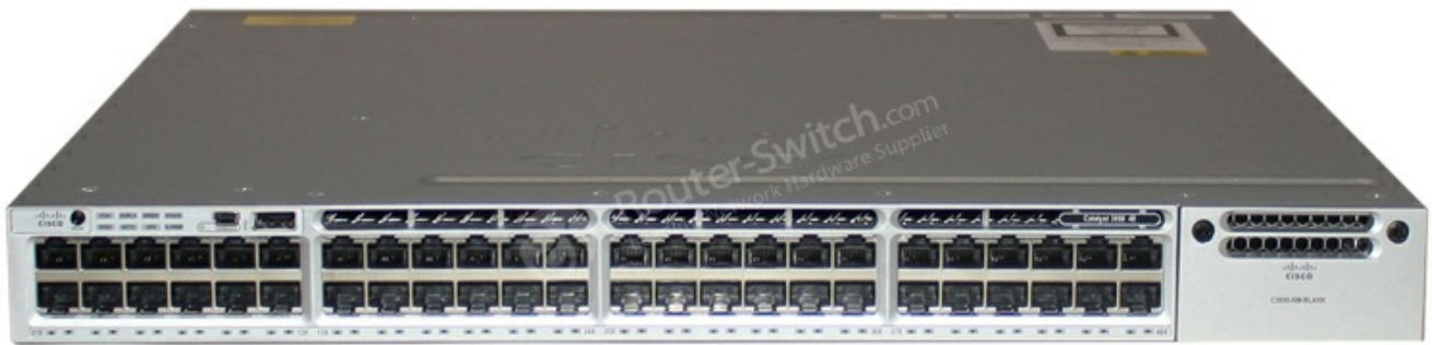
Table 1 shows the Quick Specs.

Figure 1 shows the appearance of WS-C3850-48T-L.