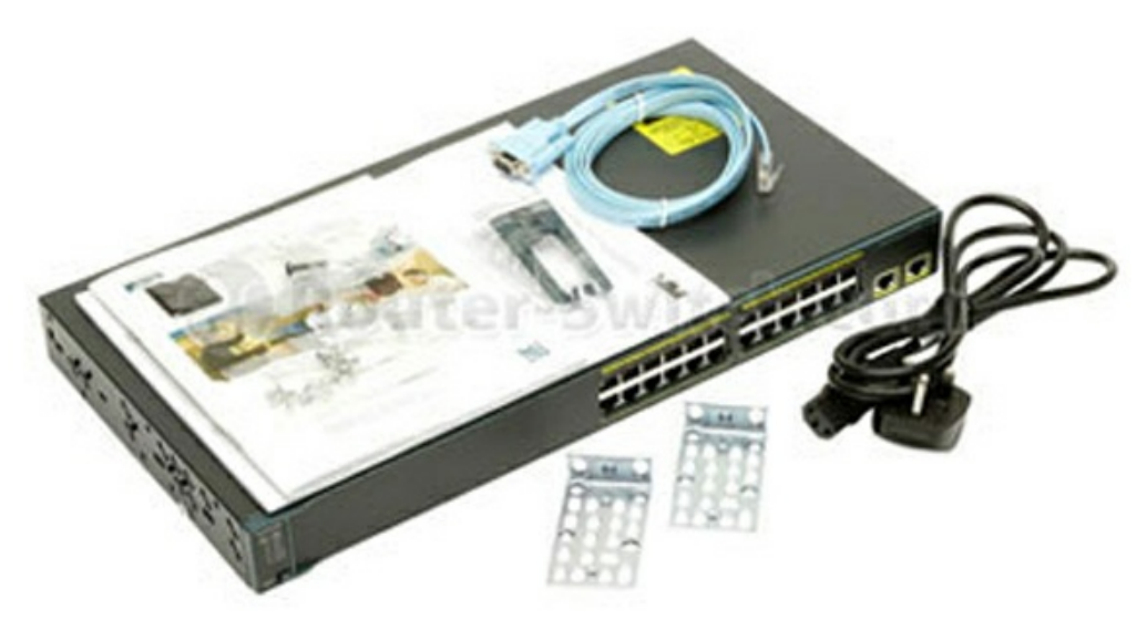
Table 1 shows the Quick Spec of the Cisco 2960-24TT-L switch.

Figure 1 shows the appearance of the Cisco WS-C2960-24TT-L switch and its accessories.