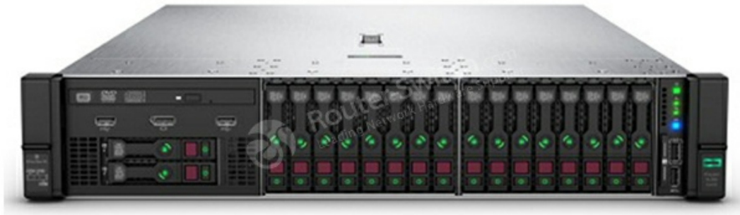
Table 1 shows the quick spec.

Figure 1 shows the appearance of HPE P02464-B21.