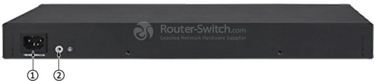
Figure 3 shows the back panel of HPE JG960A.