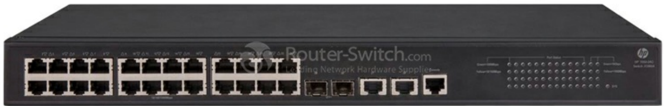
Table 1 shows the quick spec.

Figure 1 shows the appearance of HPE JG960A.